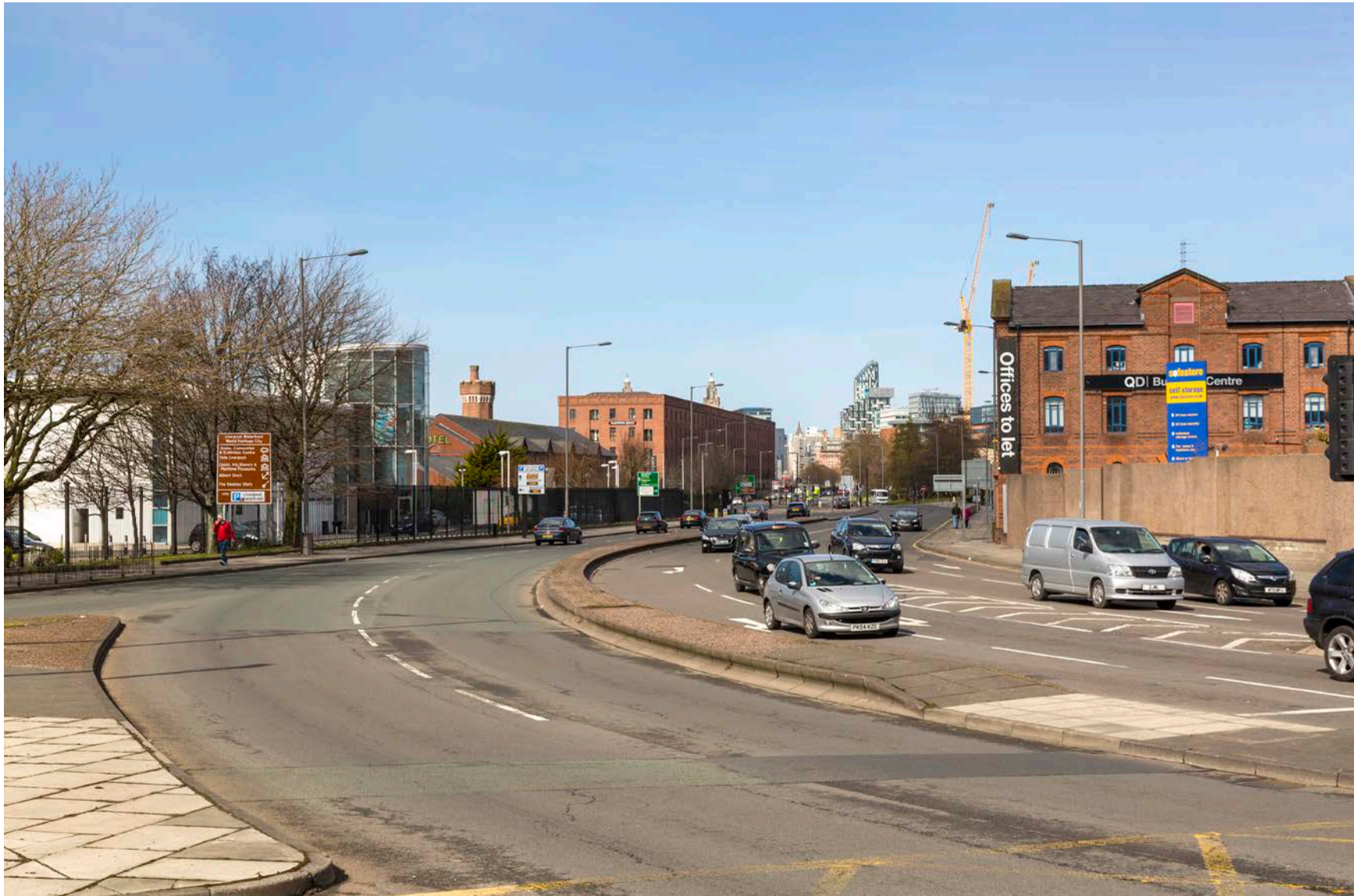
Princes Reach TVIA View 5: Parliament Street/ Chaloner Street - Existing