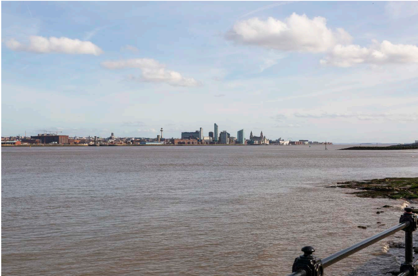
Princes Reach TVIA View 1: Magazine Parade, in front of entrance to Vale Park - Existing