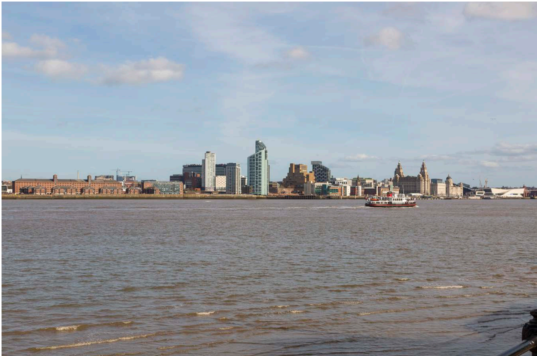
Princes Reach TVIA View 2: Wallasey Town Hall, bottom of steps up to the Town Hall - Existing