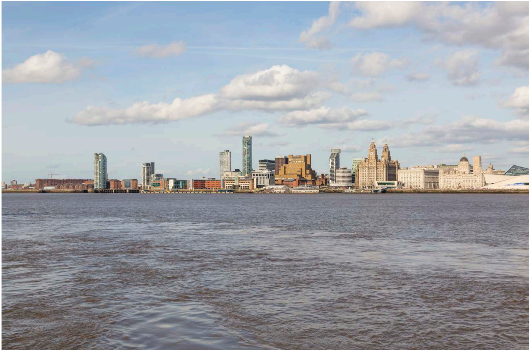
Princes Reach TVIA View 3: Birkenhead Ferry Landing - Existing