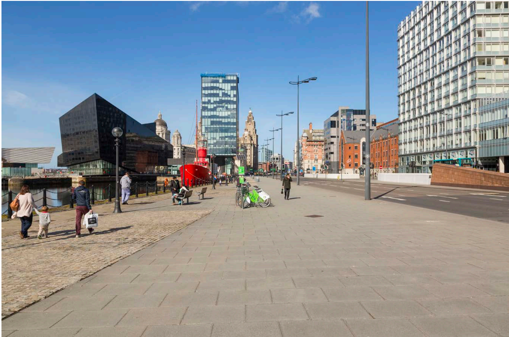
Princes Reach TVIA View 8: Albert Dock- in front of the entrance on the strand - Existing