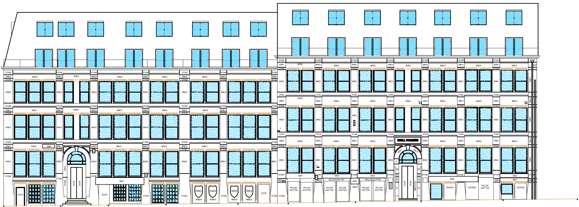
Proposed Fazakerley Street Elevation