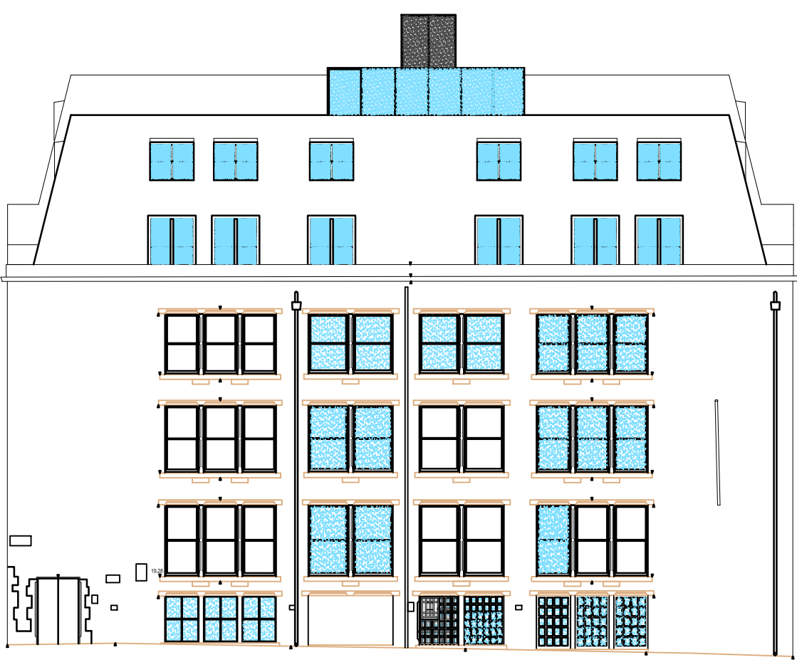
Proposed Union Street Elevation