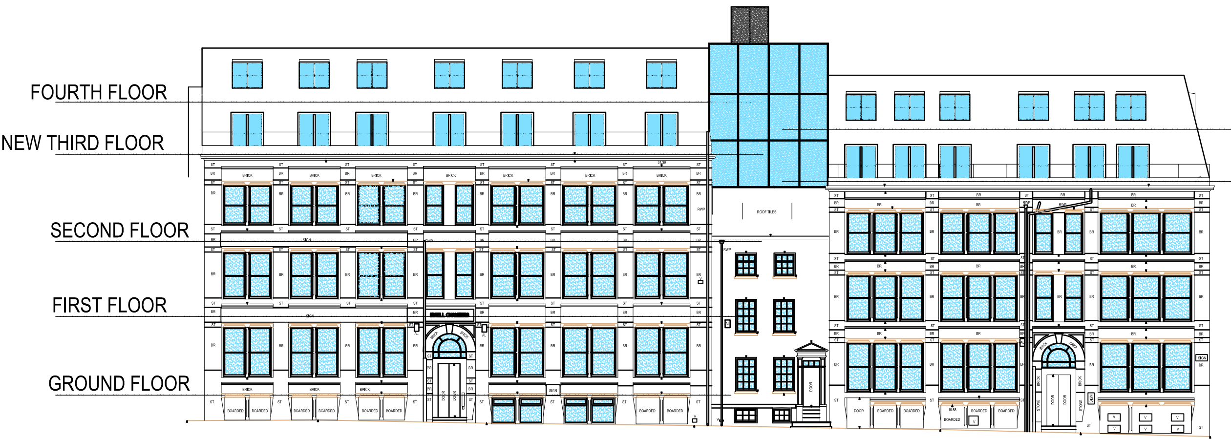
Proposed Union Street Elevation