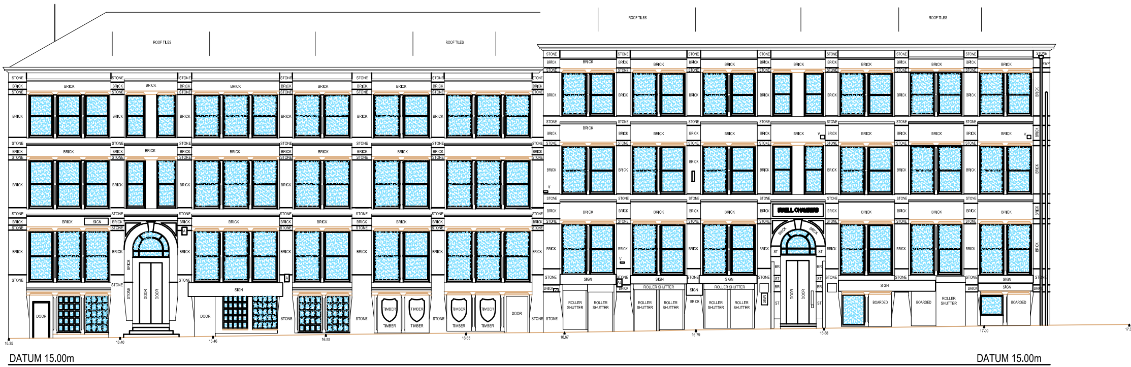
Existing Union Street Elevation