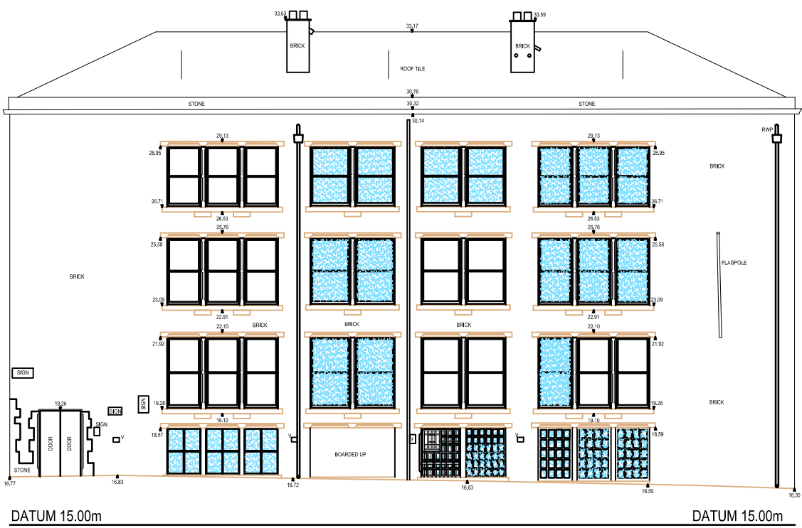
Existing Union Street Elevation