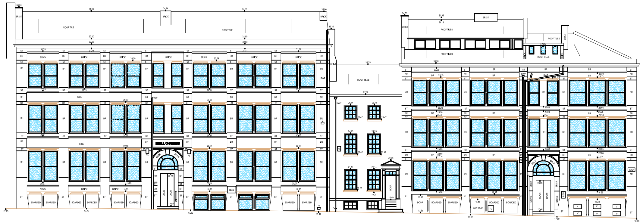
Existing Union Street Elevation