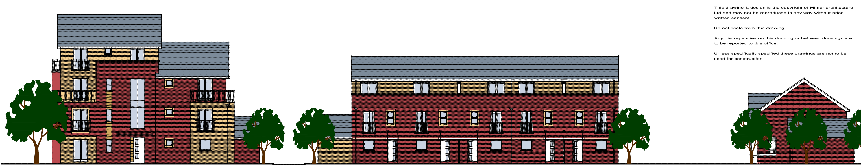
ELEVATION TO GARSTON ROAD

This drawing & design is the copyright of Mimar architecture Ltd and may not be reproduced in any way without prior written consent. Do not scale from this drawing. Any discrepancies on this drawing or between drawings are to be reported to this office. Unless specifically specified these drawings are not to be used for construction.