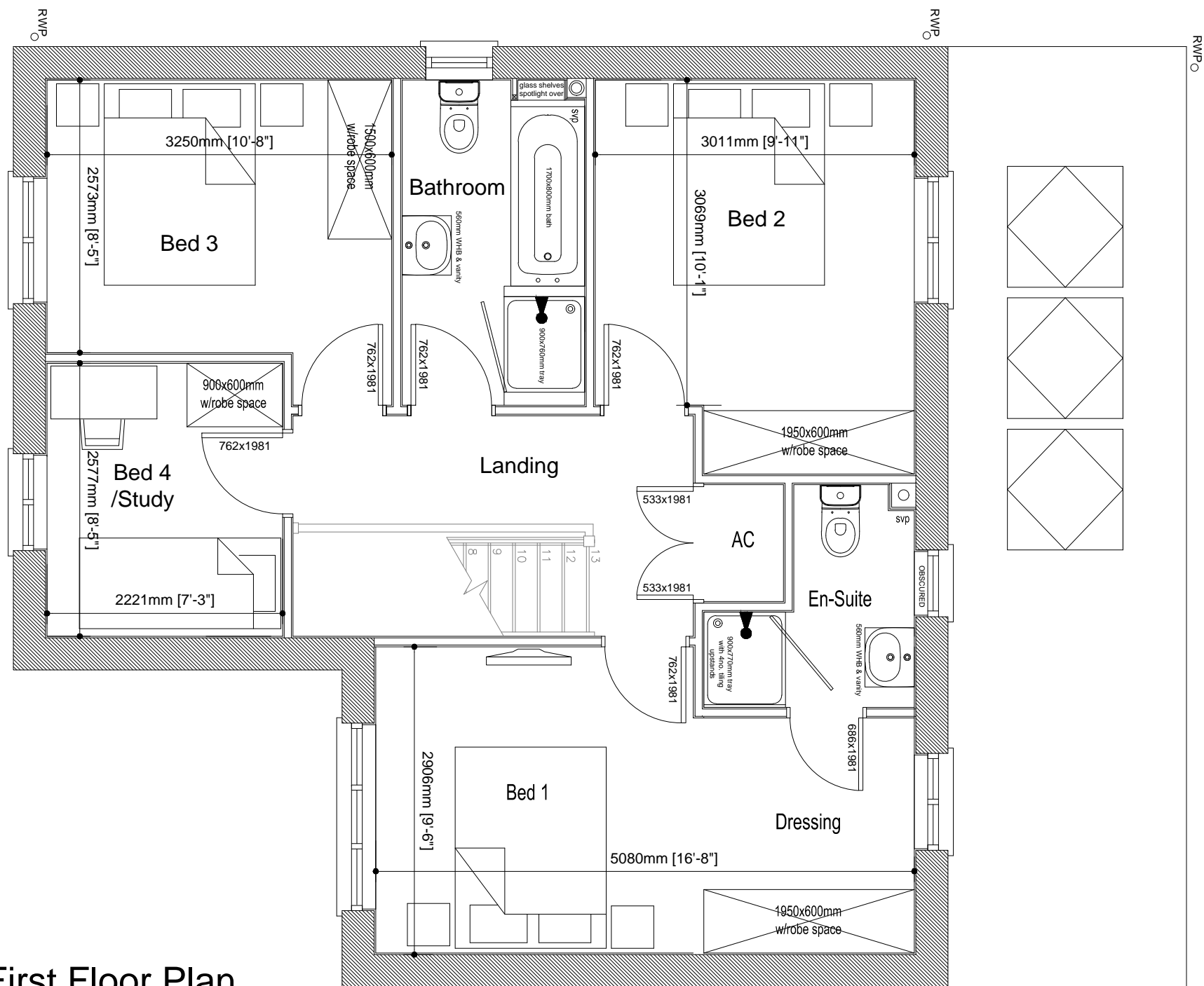
First Floor Plan Scale 1:50