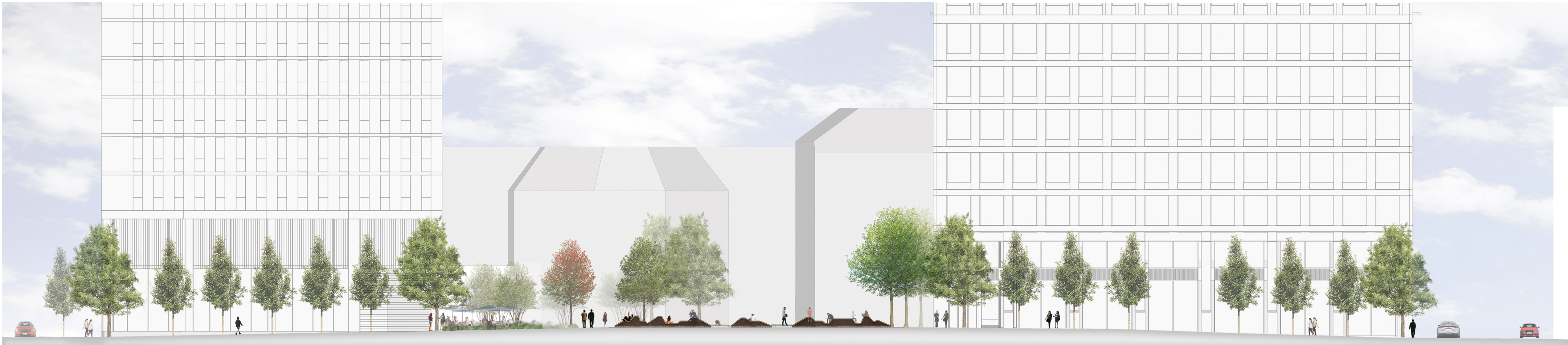
0002 Section A-A 01 1:200