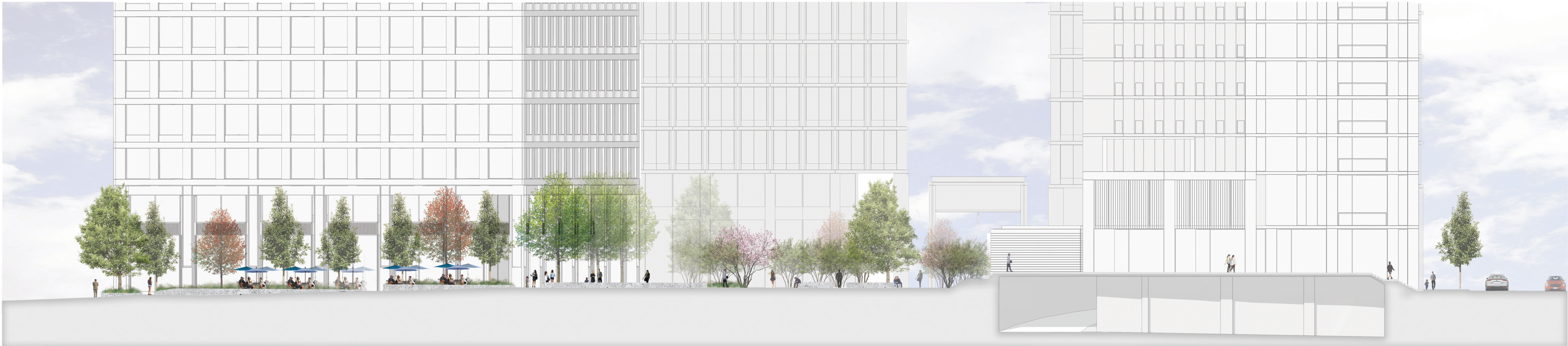
0002 Section B-B 02 1:200