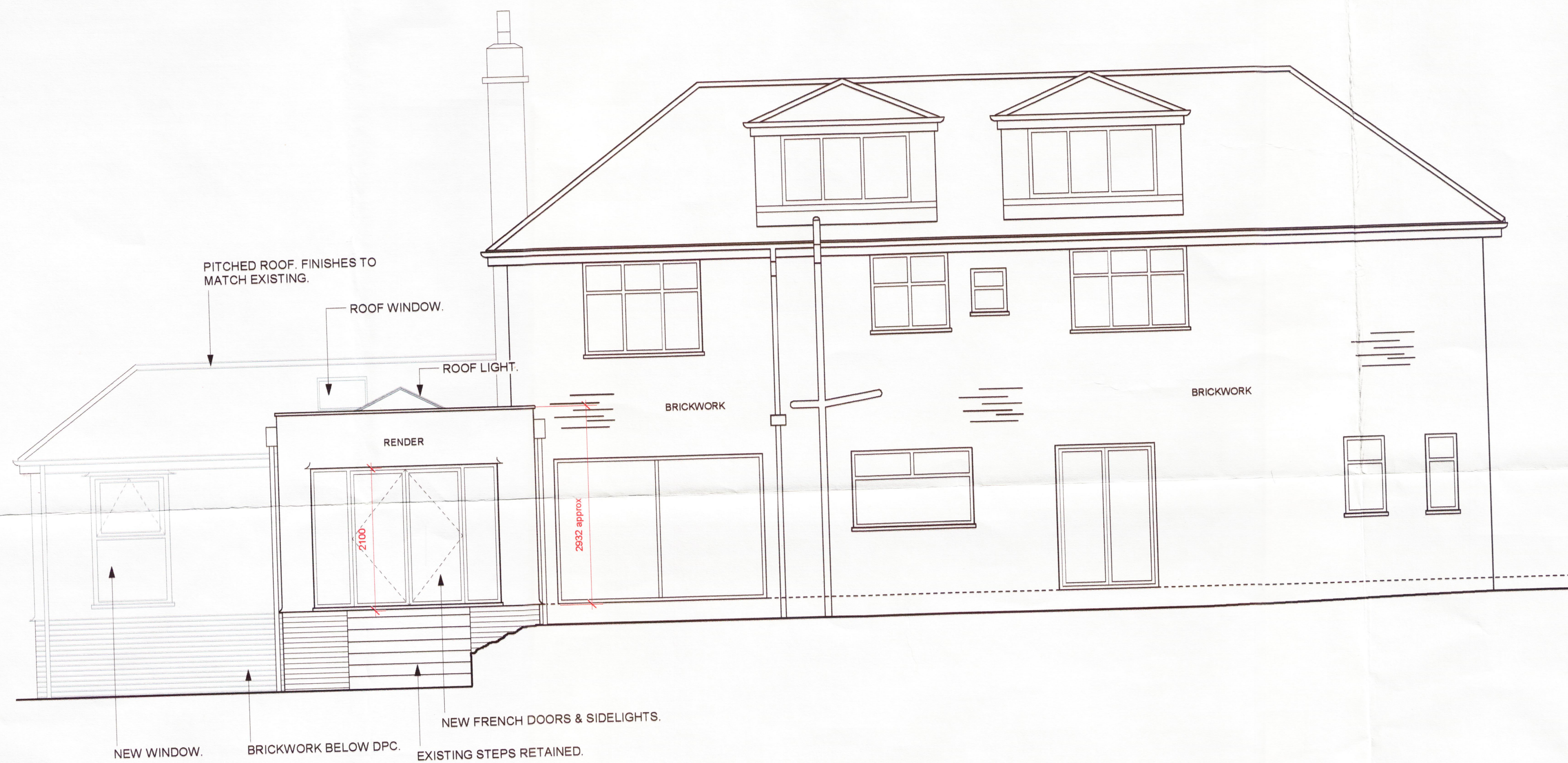
2 ELEVATION - PROPOSED REAR SCALE 1:50 @ A1