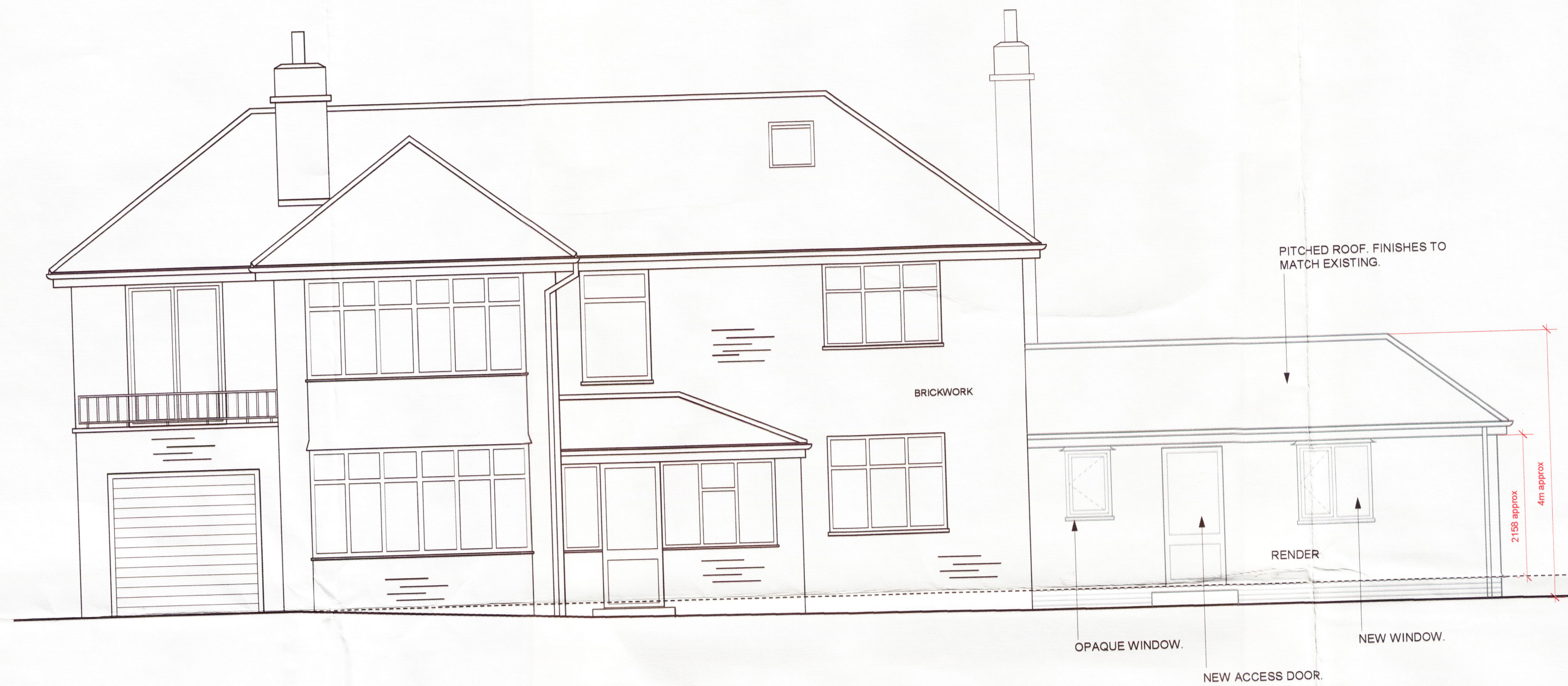
1 ELEVATION - PROPOSED FRONT SCALE 1:50 @ A1