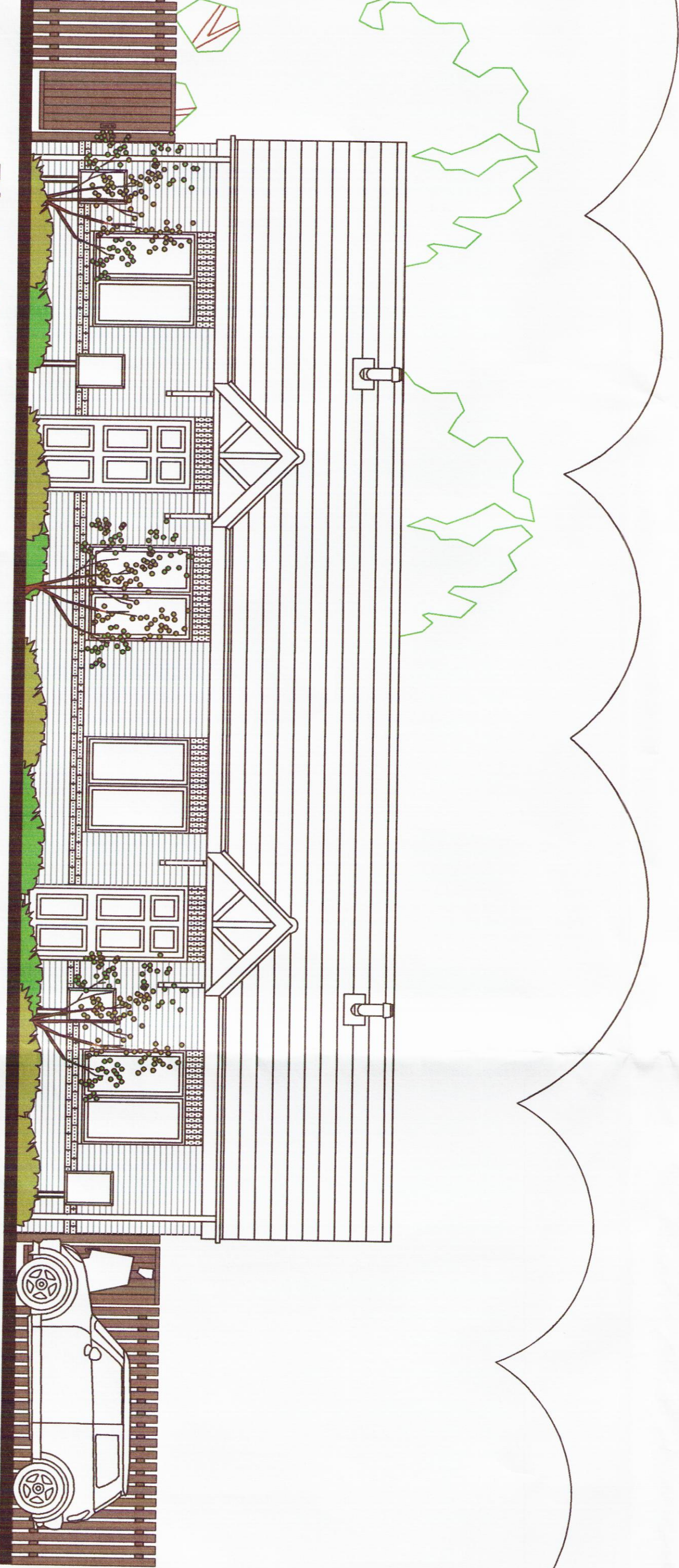
Plots 18-19 (17.25m Slab Level) Proposed Streetscene C-C (Scale 1:50 @A0)