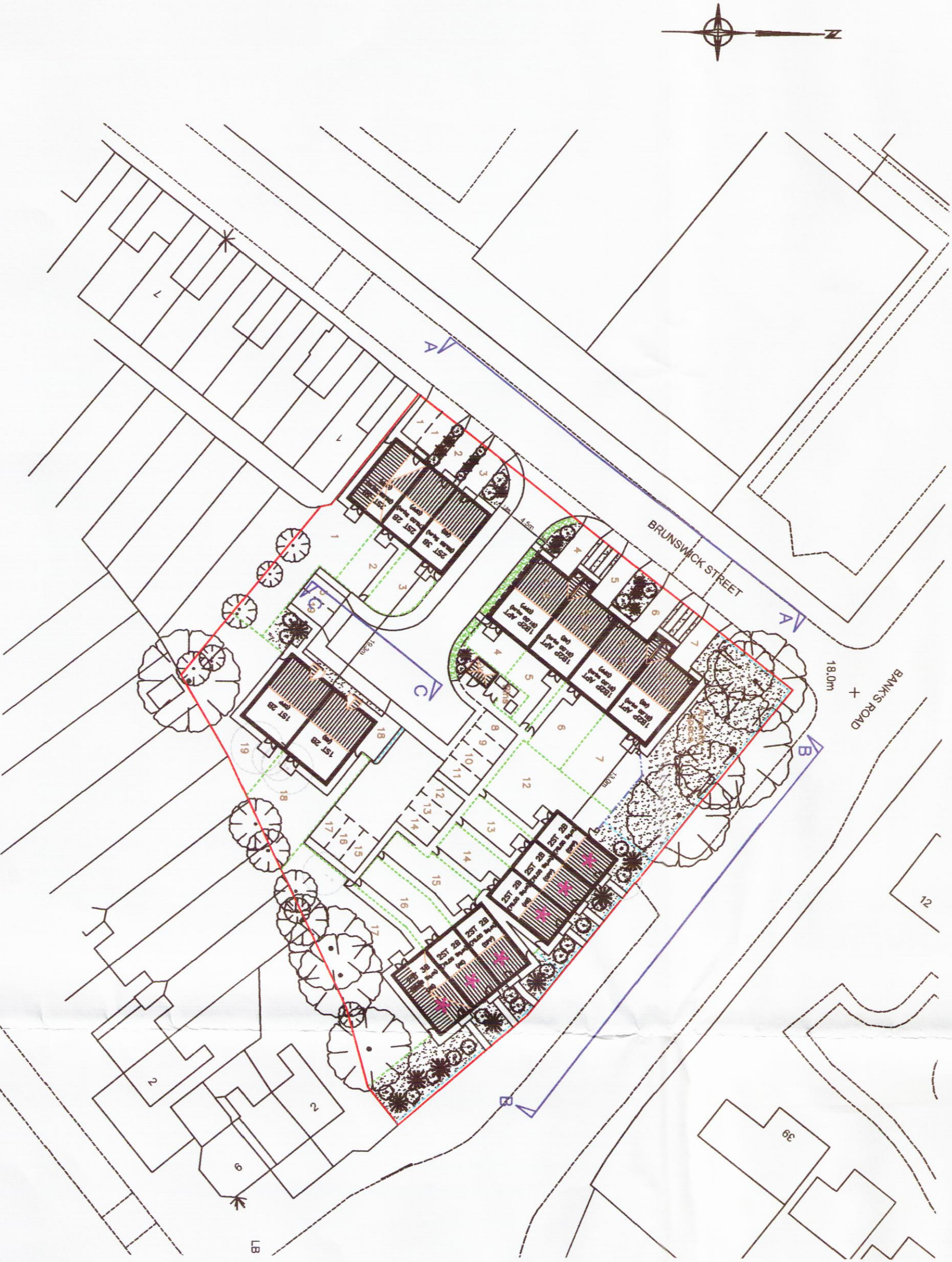
Site Plan (Scale 1:500 @A0)