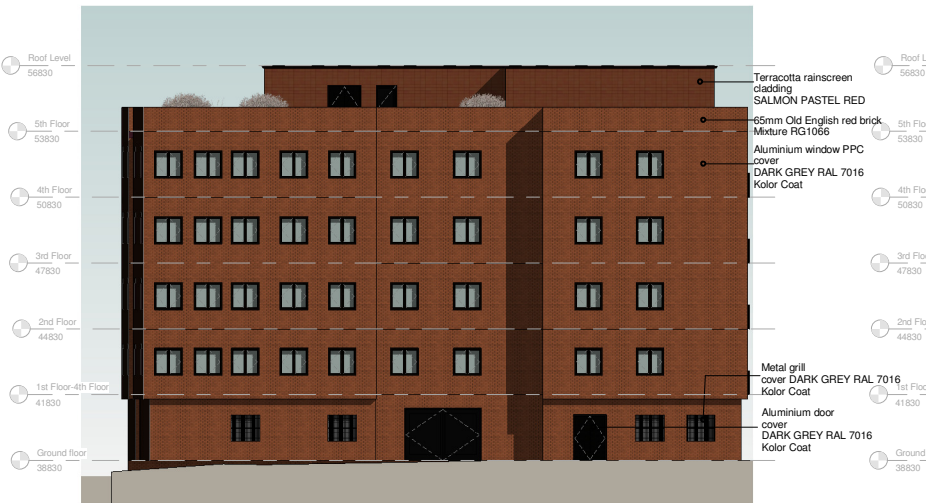
3 Elevation to Brindley Street 1:100