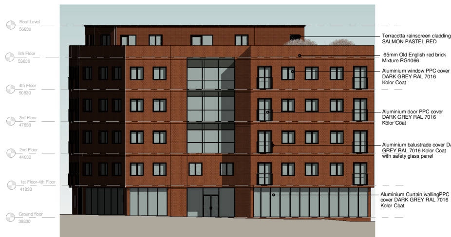
1 Elevation to Parliament Street 1:100