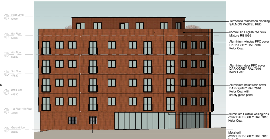
2 Elevation to Grafton Street 1:100