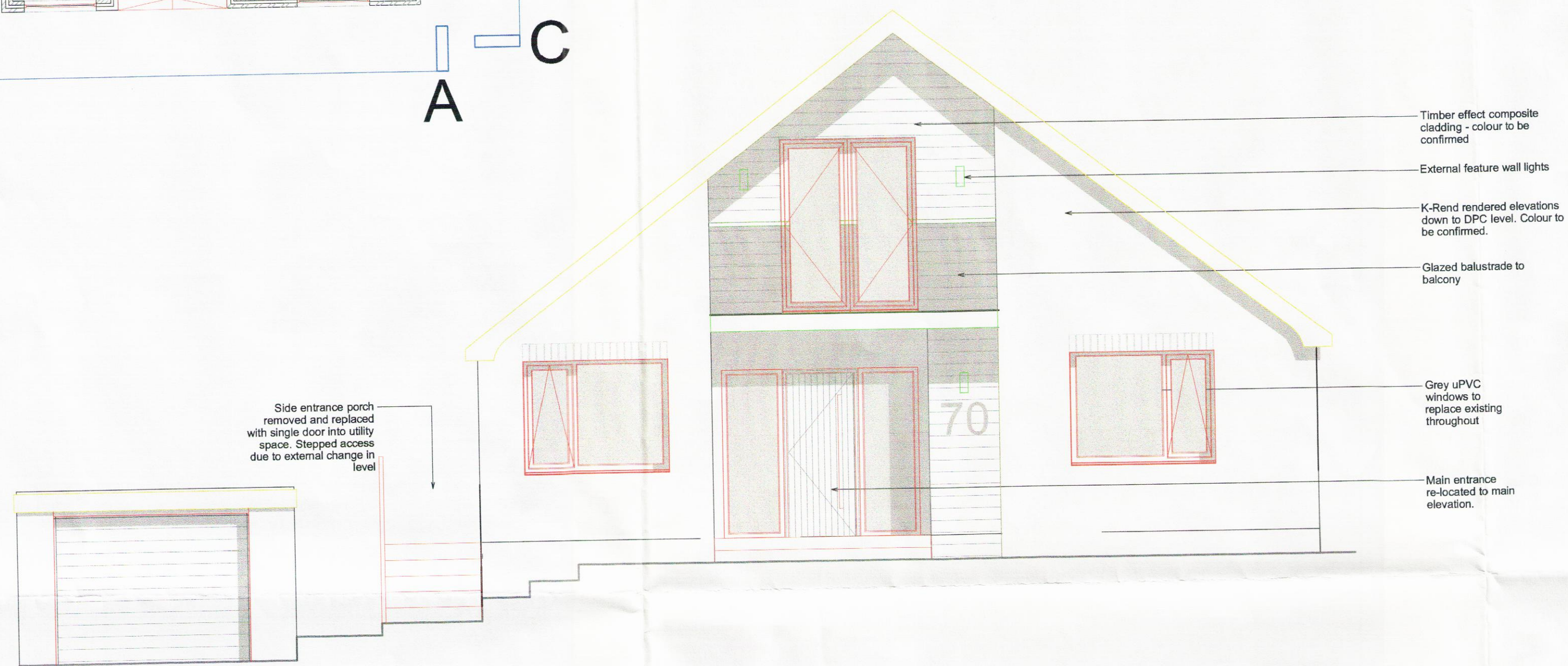
FRONT ELEVATION - A scale 1:50