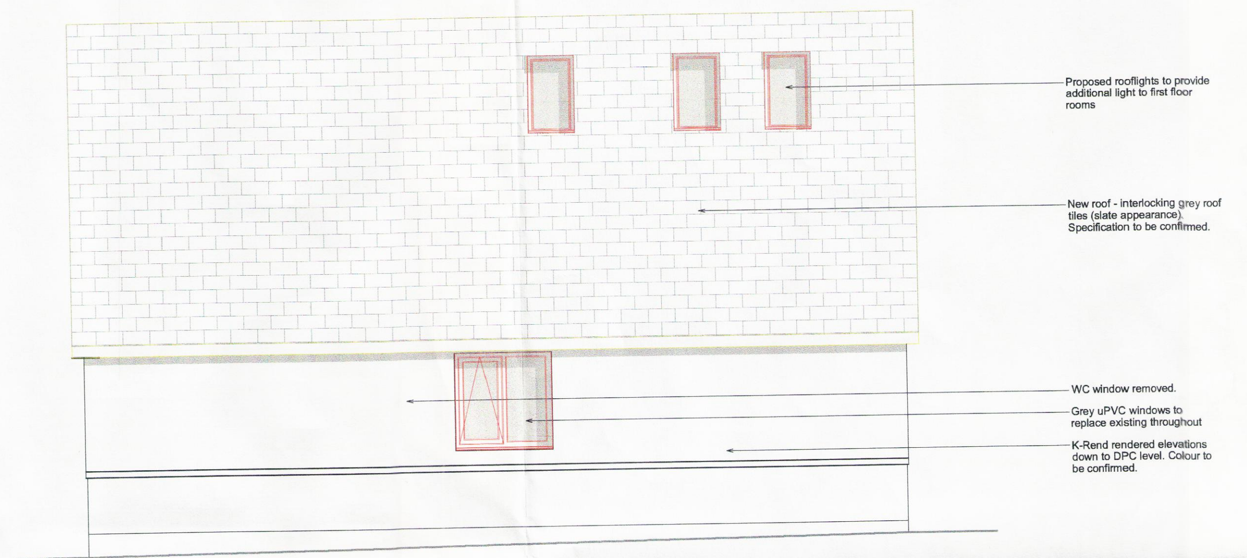
SIDE ELEVATION - C scale 1:50