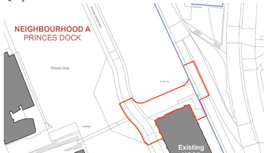
Figure 1 – Extract from Site Location Plan detailing the development boundary