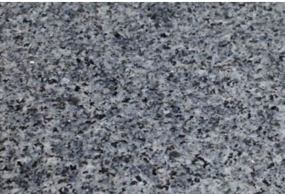
Material: Granite Manufacturer: Hardscape or equal and approved Colour: Kobra Finish: Flamed Size: 300x100x65