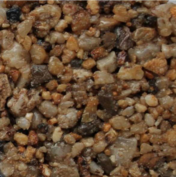
Material: Resin Manufacturer: Addagrip or equal and approved Colour: Rhine Gold Size: 10mm