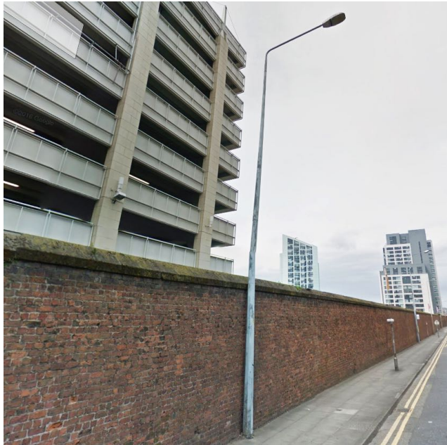
8-12m Columns - Bath Street - [EXISTING]