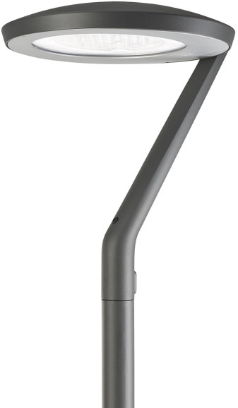
6m Columns - Dock Wall Opening - [PROPOSED]