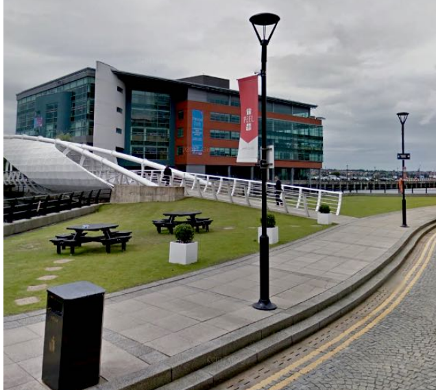
6m Columns - William Jessop Way - [EXISTING]