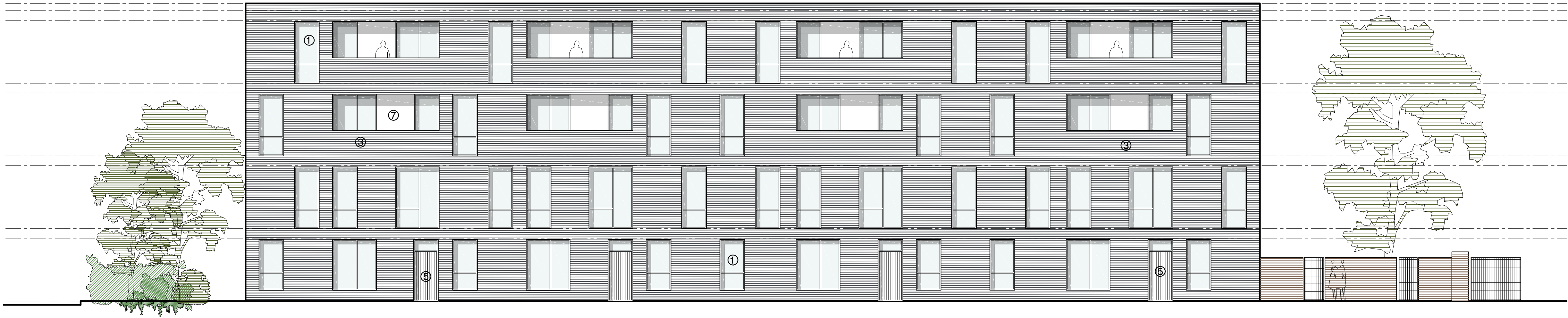
VINE STREET (east) ELEVATION BLOCK B