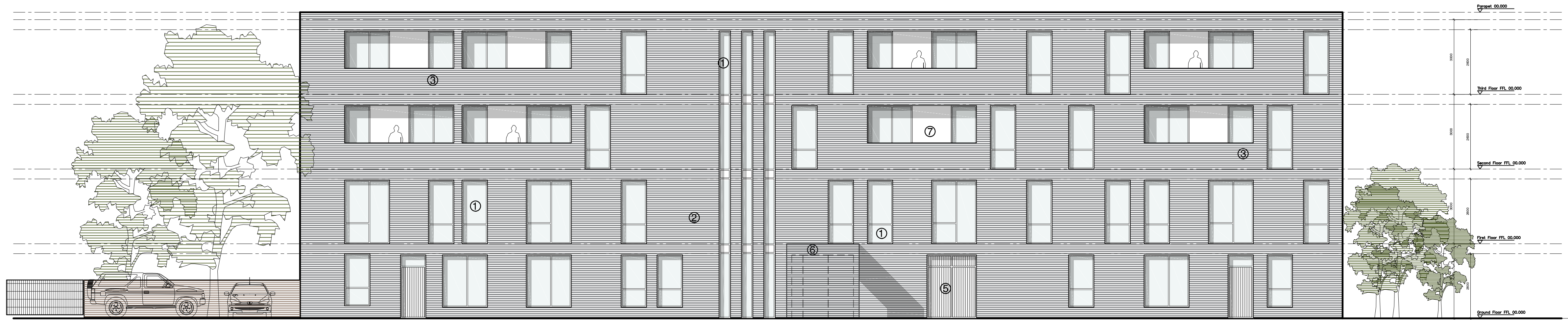
COURTYARD (west) ELEVATION BLOCK B