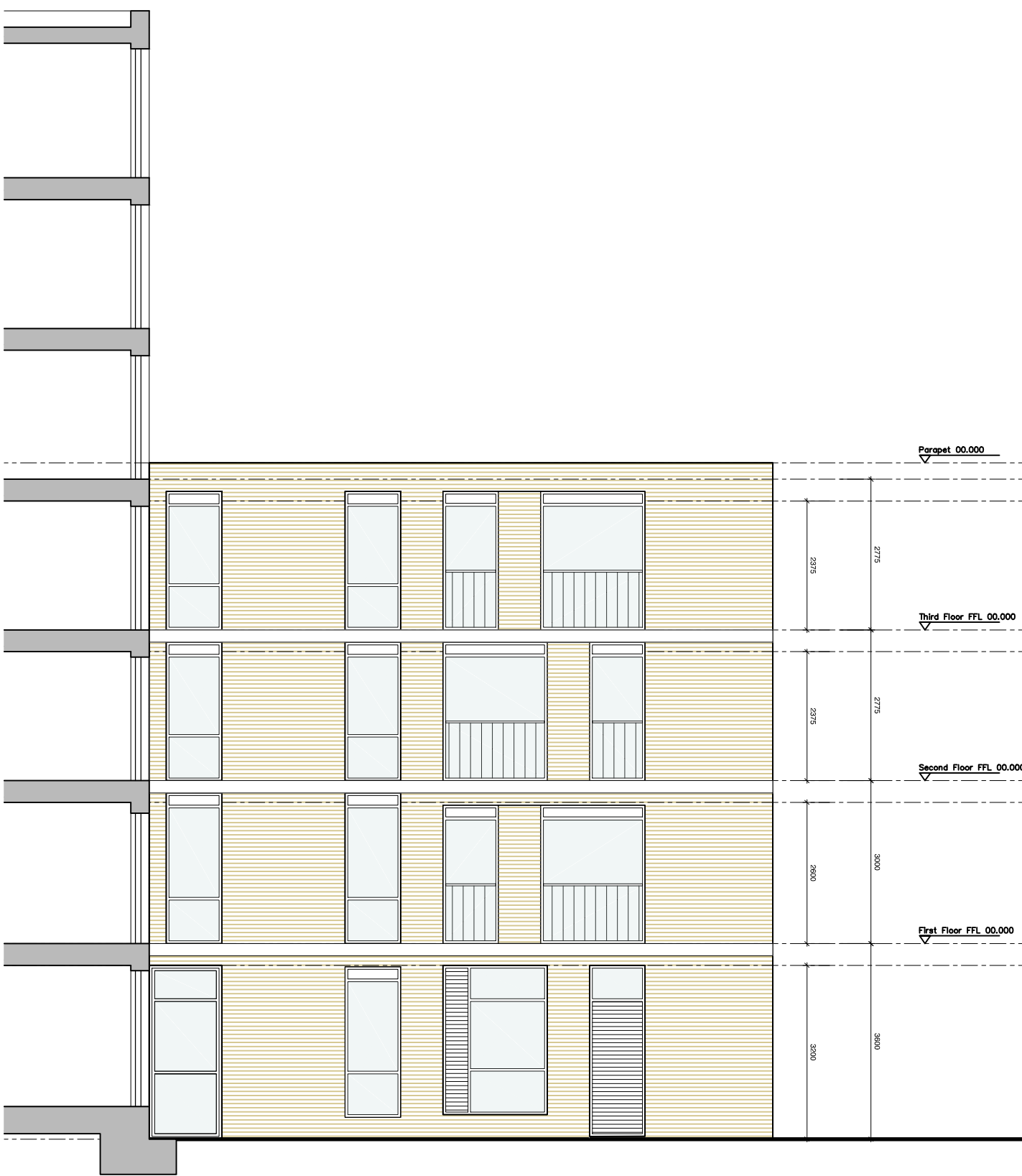
COURTYARD (east) ELEVATION BLOCK A