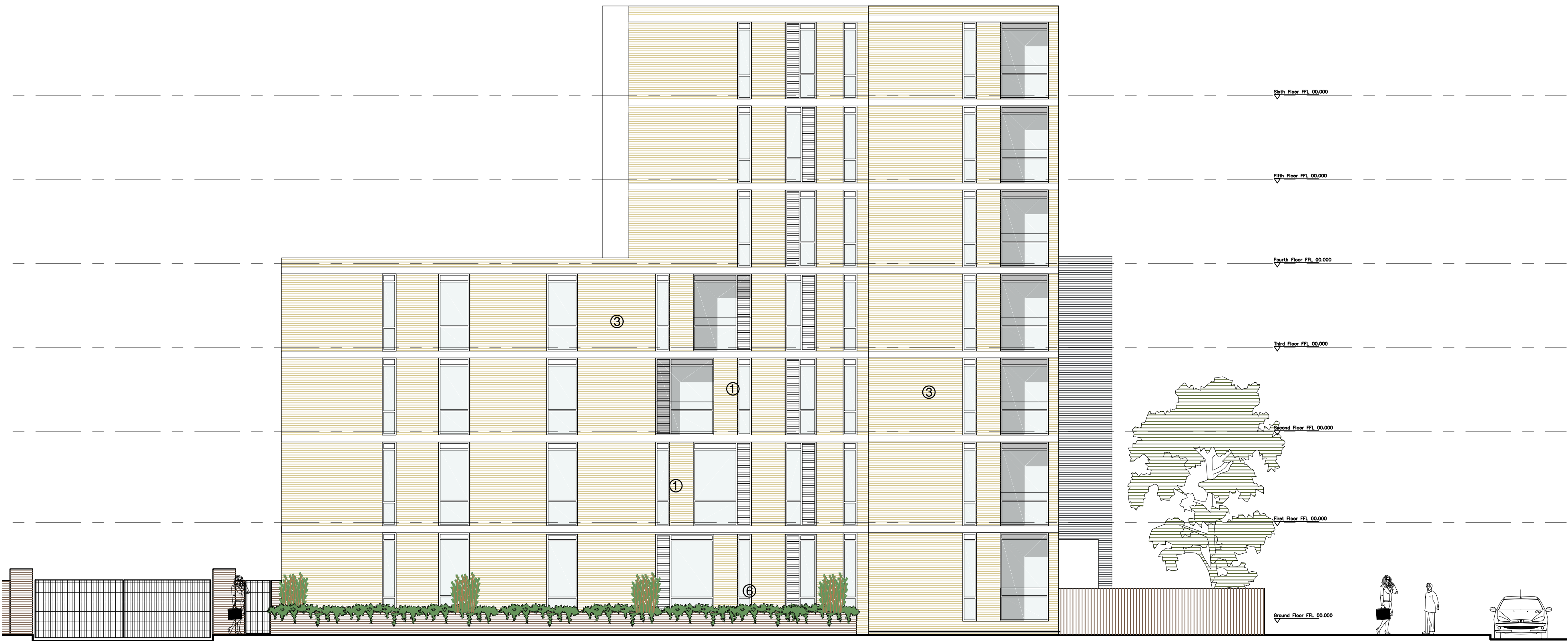
VINE STREET (east) ELEVATION BLOCK A