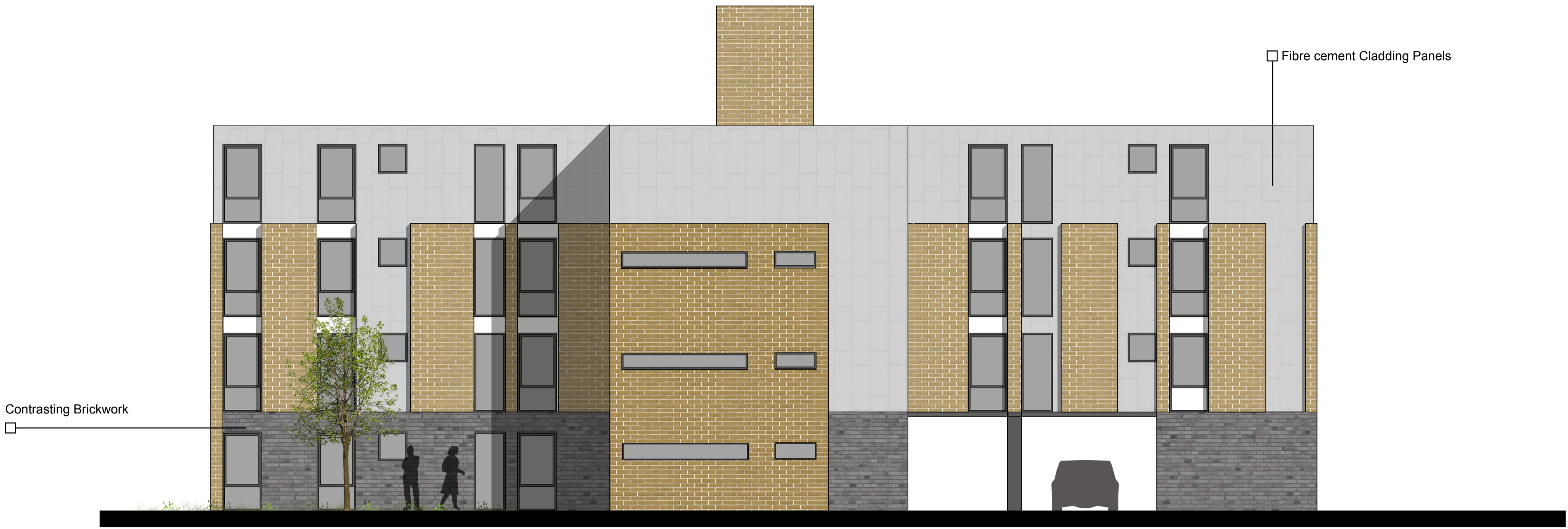
Steble Street Elevation