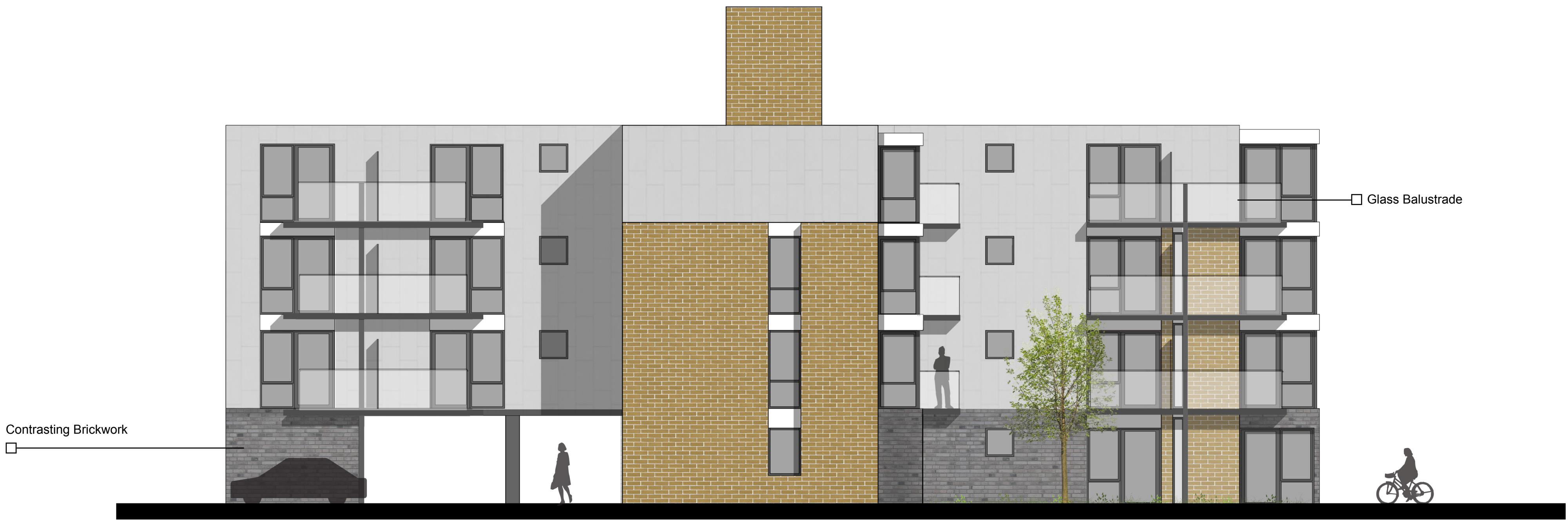
Park Street Elevation