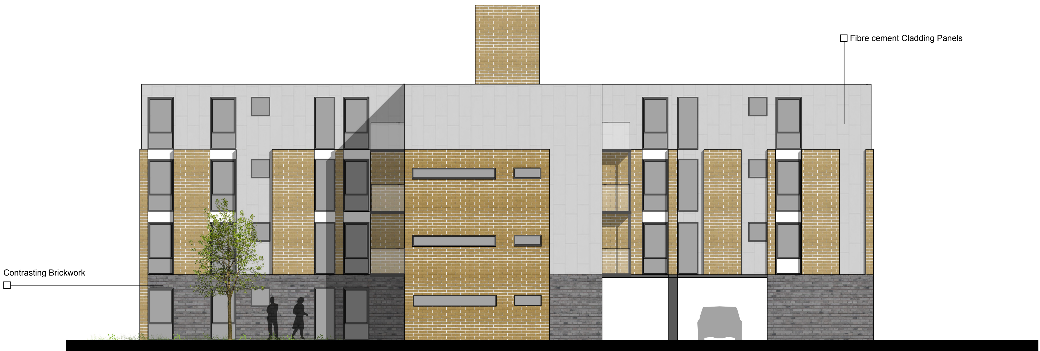
Steble Street Elevation