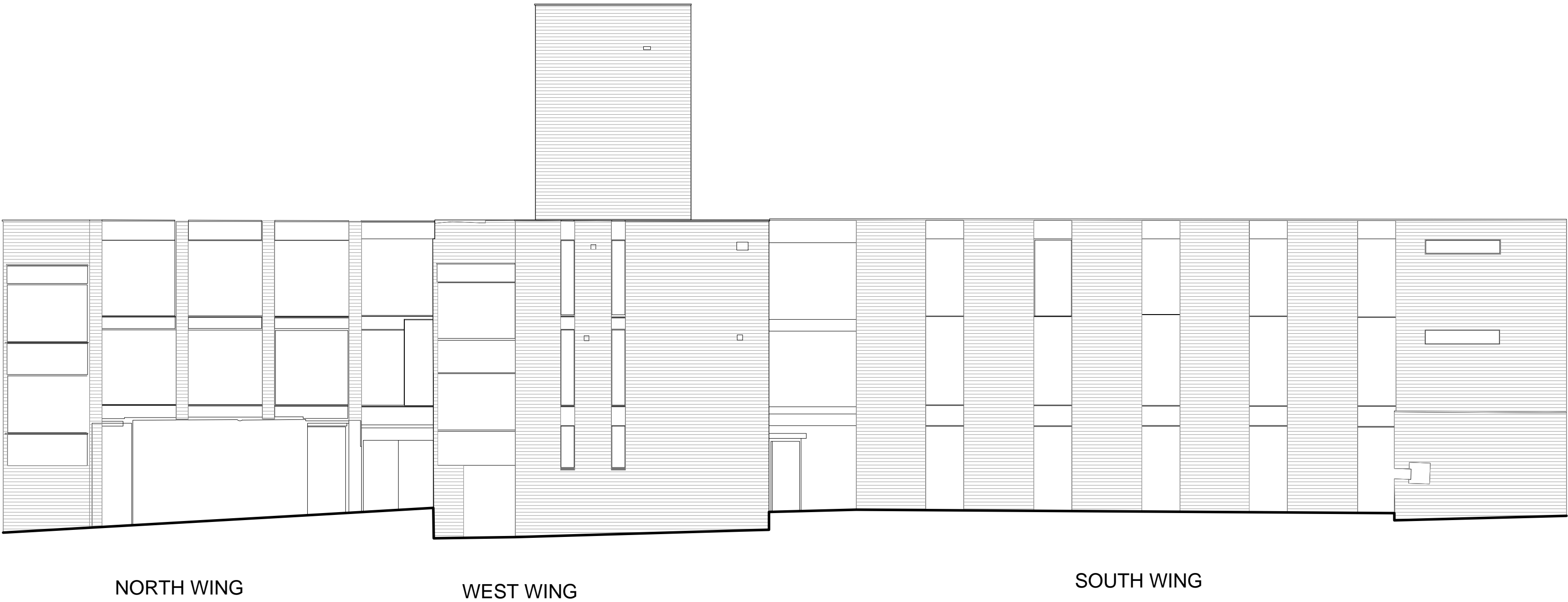
UPPER ESSEX STREET ELEVATION