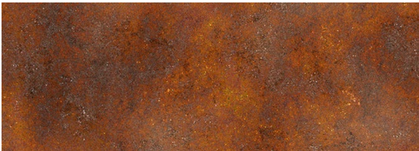
MATERIAL 4: COR-TEN NATURALLY WEATHER STEEL