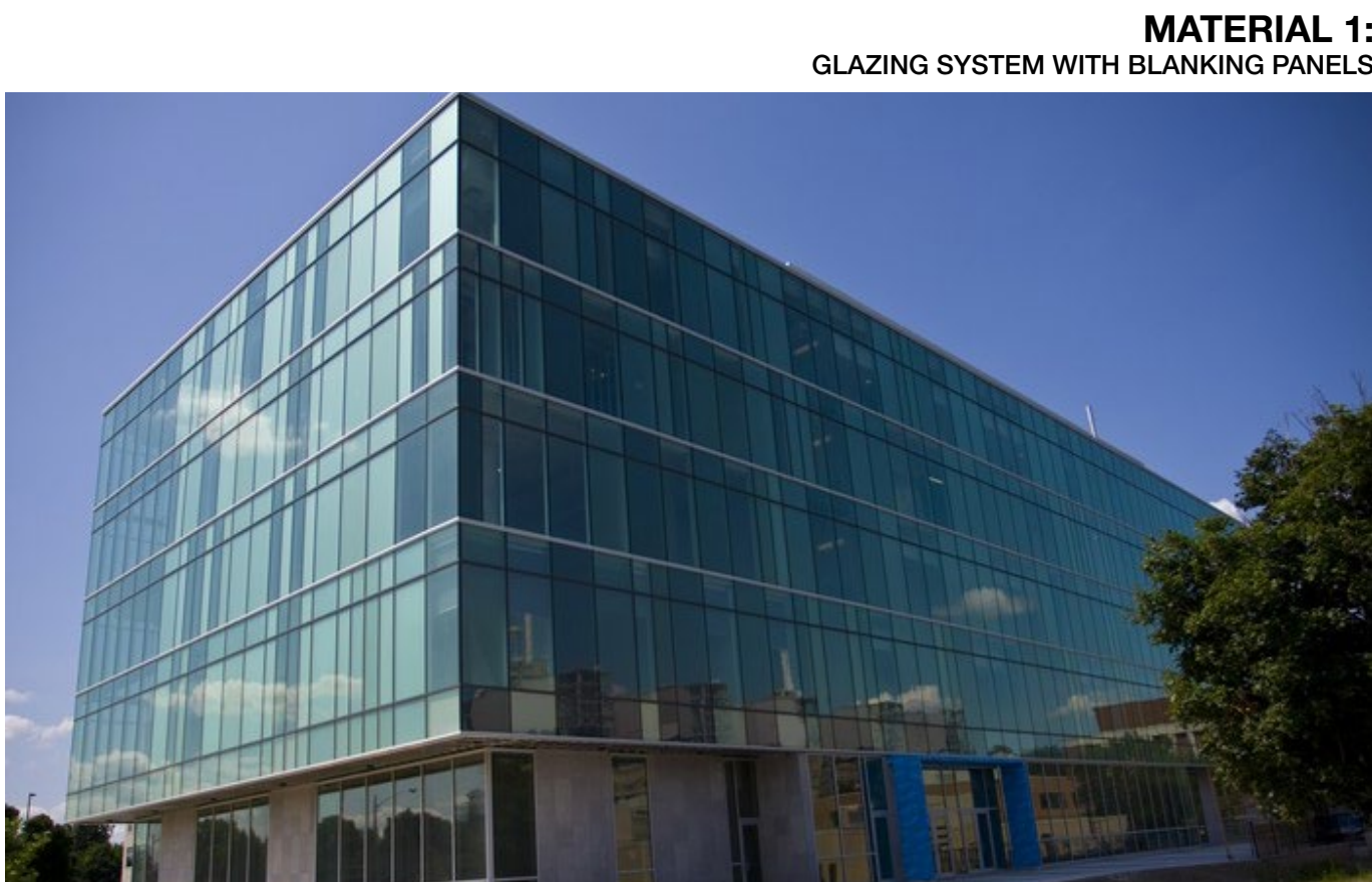
MATERIAL 1: GLAZING SYSTEM WITH BLANKING PANELS