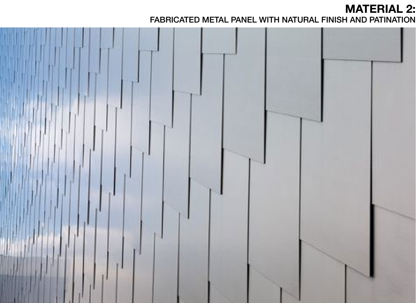
MATERIAL 2: FABRICATED METAL PANEL WITH NATURAL FINISH AND PATINATION