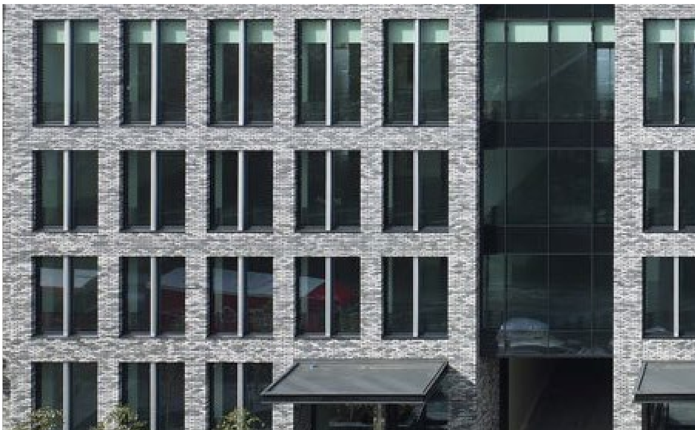
MATERIAL 3: DARK FACING BRICK