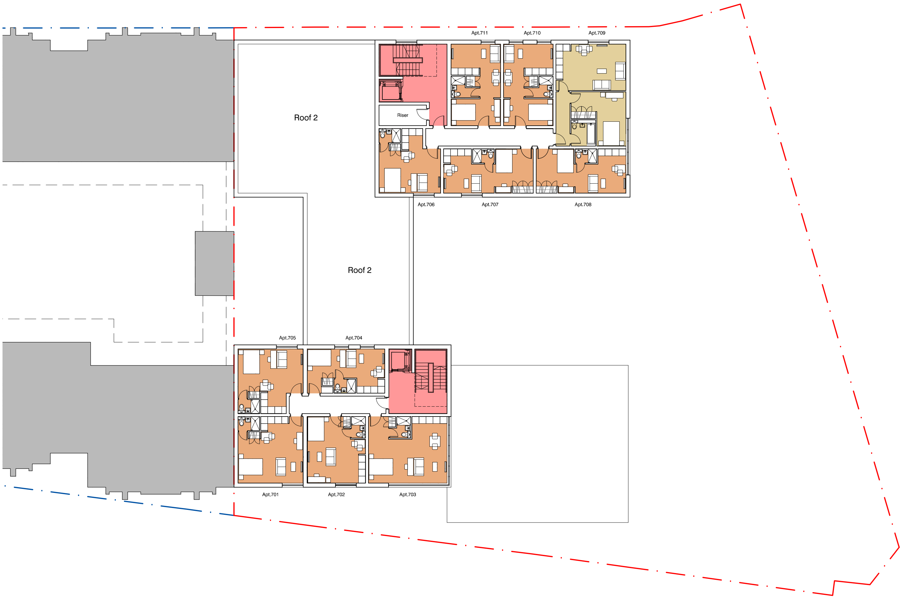
SEVENTH FLOOR PLAN