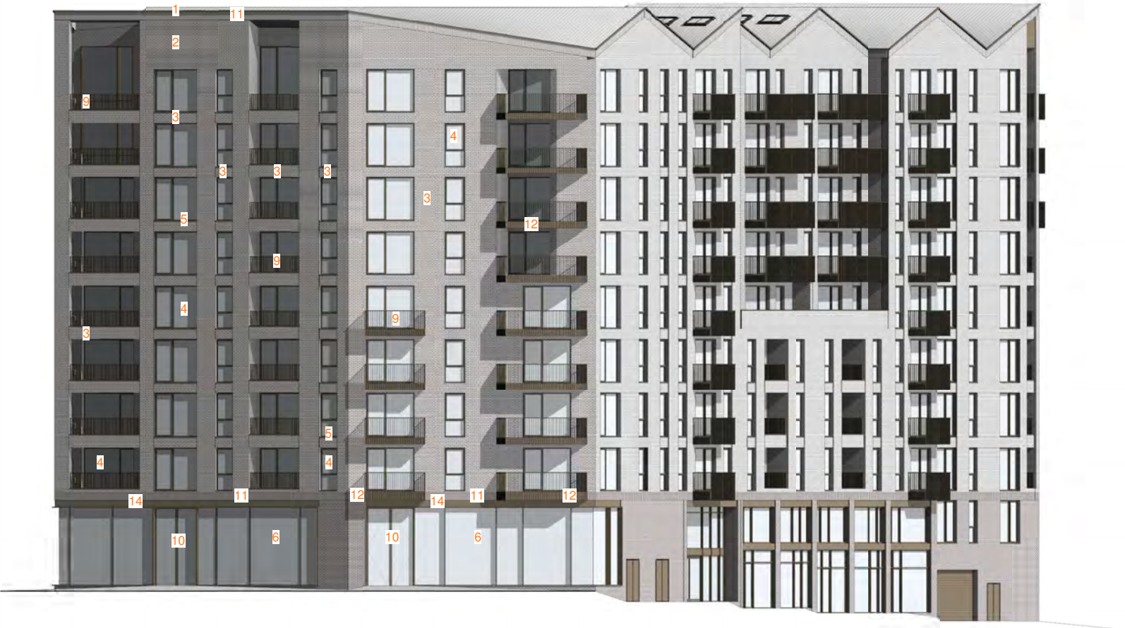
DRAWING BY TIM GROOM ARCHITECTS