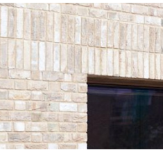
⑦ Soldier course