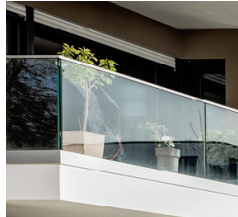
⑥ Glass Balustrade