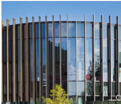
④ Vertical Metal Cladding