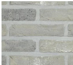
② Grey Brick