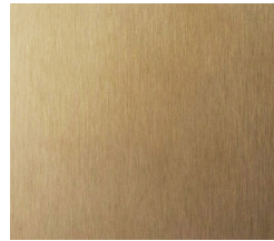
③ Bronze Metal Cladding