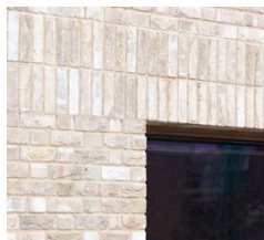
⑦ Soldier course