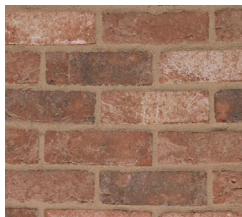
① Red Brick