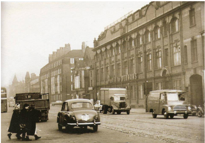
1960's - Scotland Road