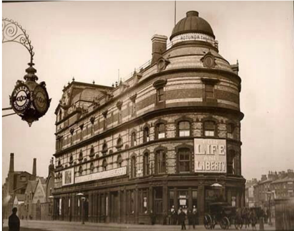
1960's - The Rotunda Theatre