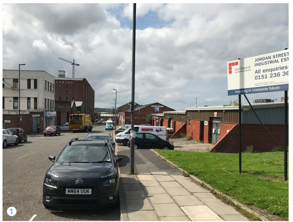
View West looking down Greenland Street.