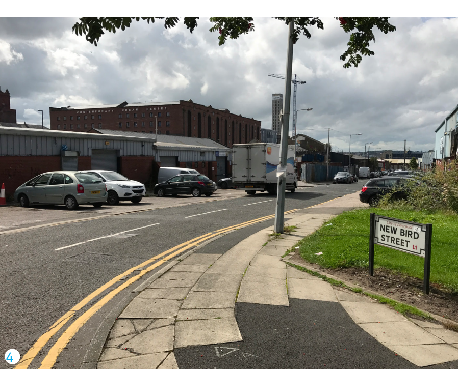
View from the corner of the New Bird Street and St James Street.