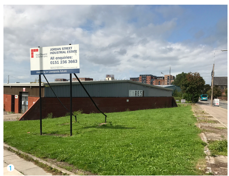
View North looking at the corner of the site from St James Street.