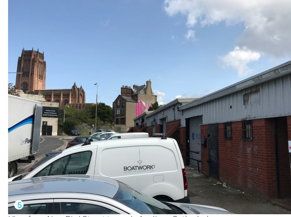
View from New Bird Street towards Anglican Cathedral.