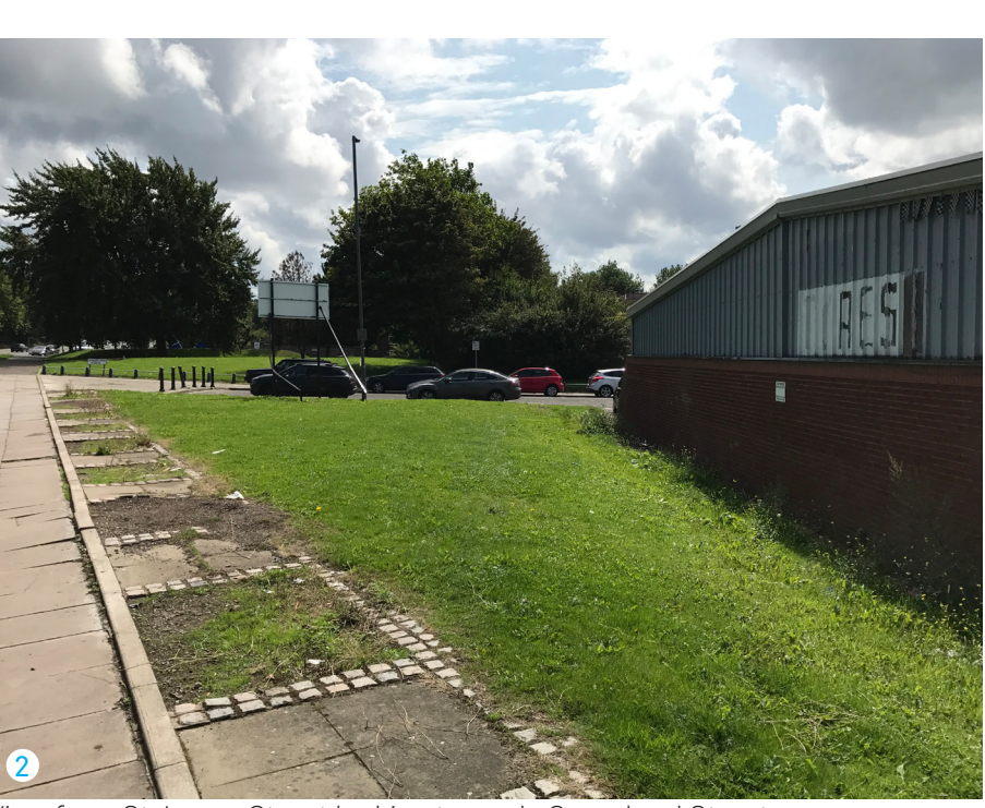
View from St James Street looking towards Greenland Street.