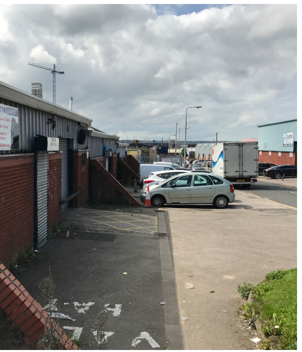
View of the existing warehouse currently occupying the site..