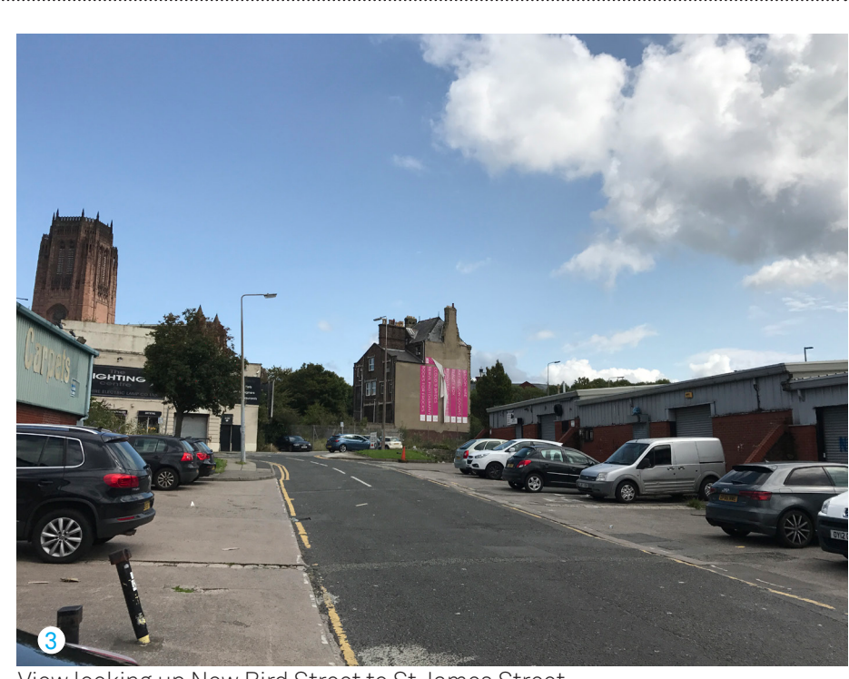
View looking up New Bird Street to St James Street.