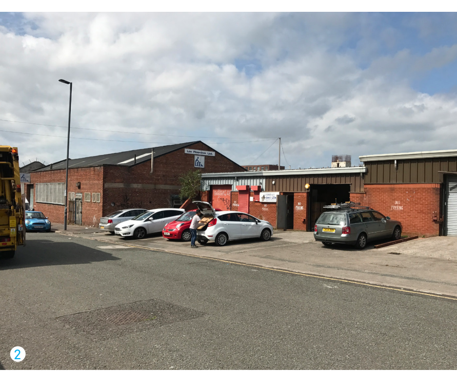
View from Greenland Street towards the warehouse at the site.