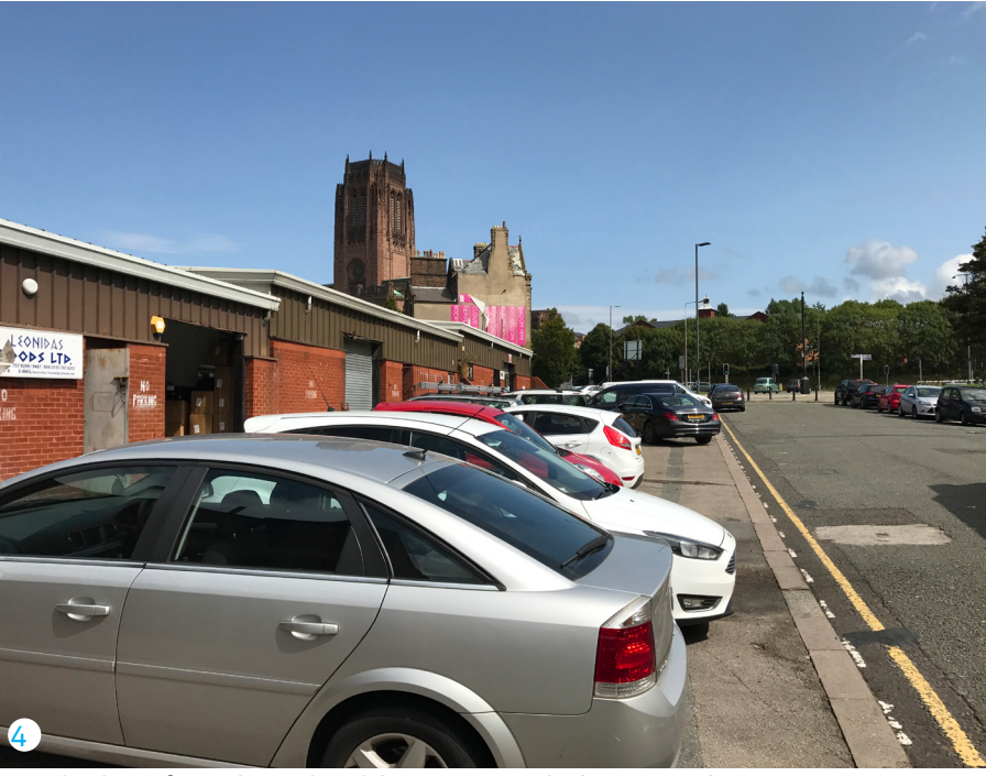
View looking from Greenland Street towards St James Court.