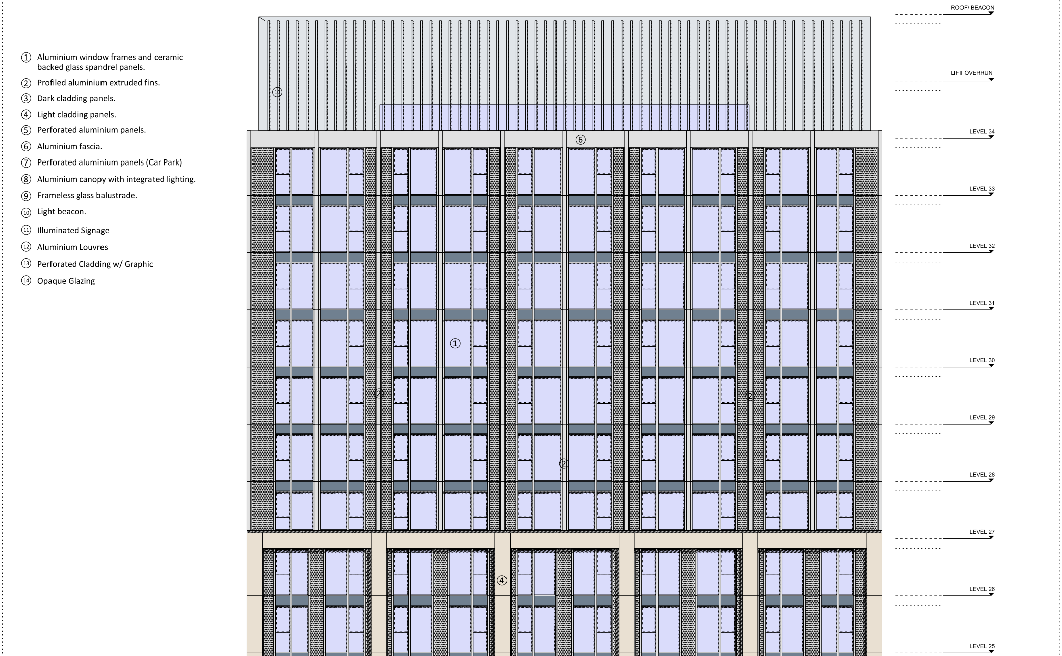
Car Park Elevation - Upper Levels