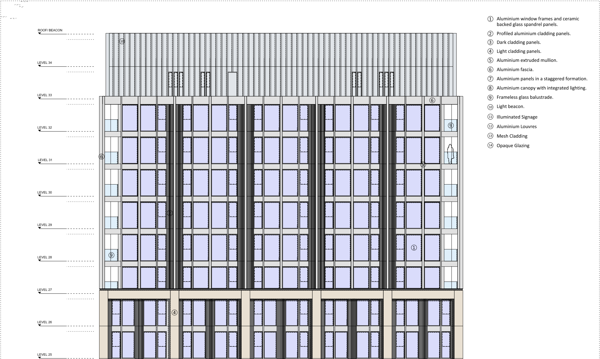
Service Road Elevation - Upper Levels