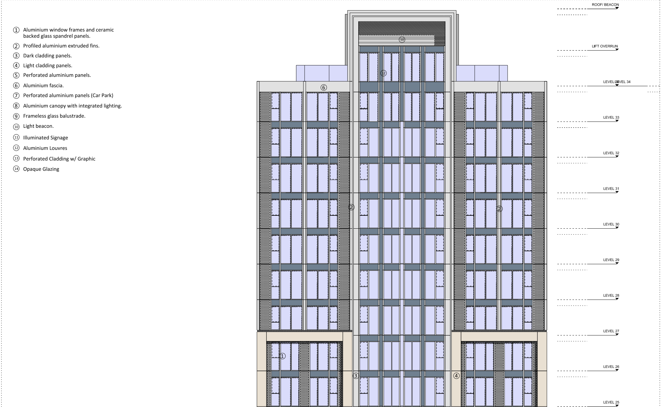
Bath Street Elevation - Upper Levels