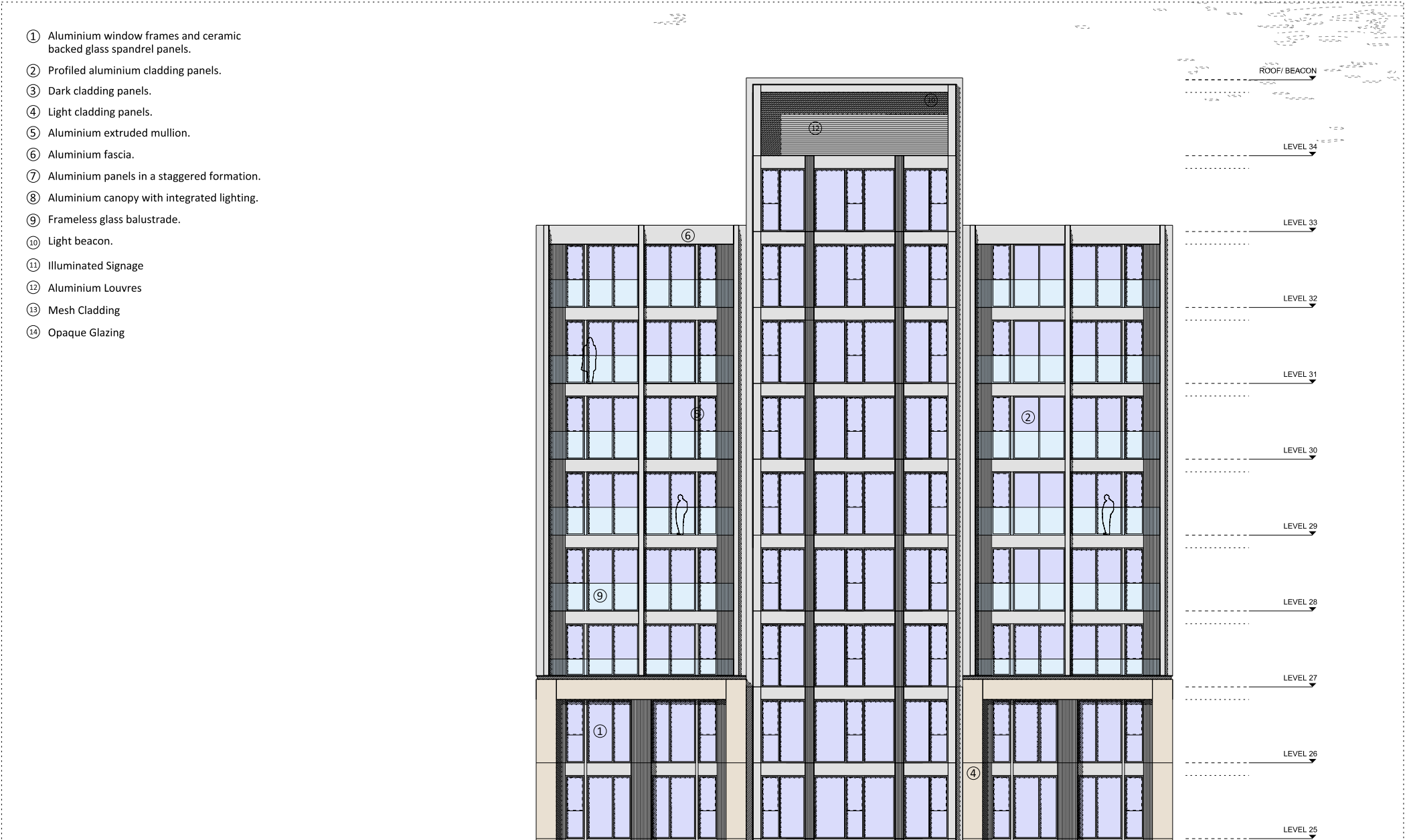
Bath Street Elevation - Upper Levels