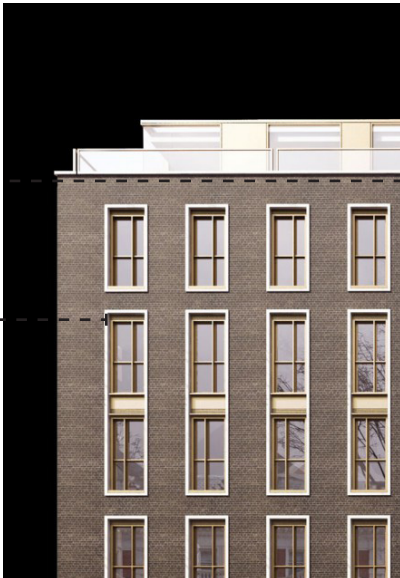
Modern architectural language