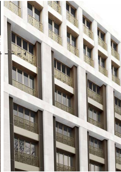
Perforated aluminium balcony