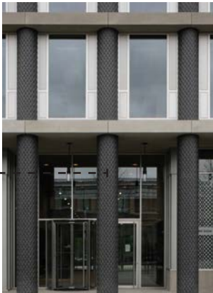
Patternated concrete columns