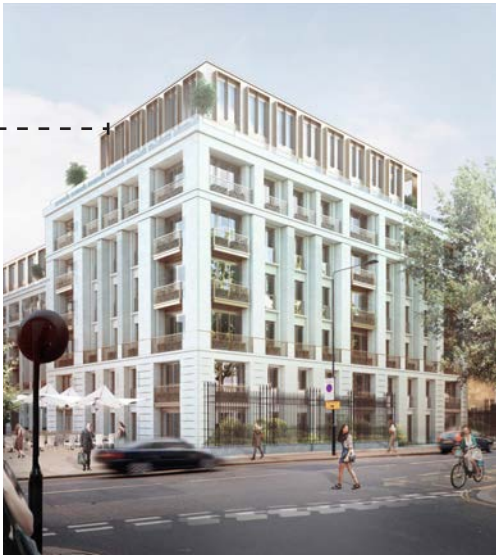
Recess top floor