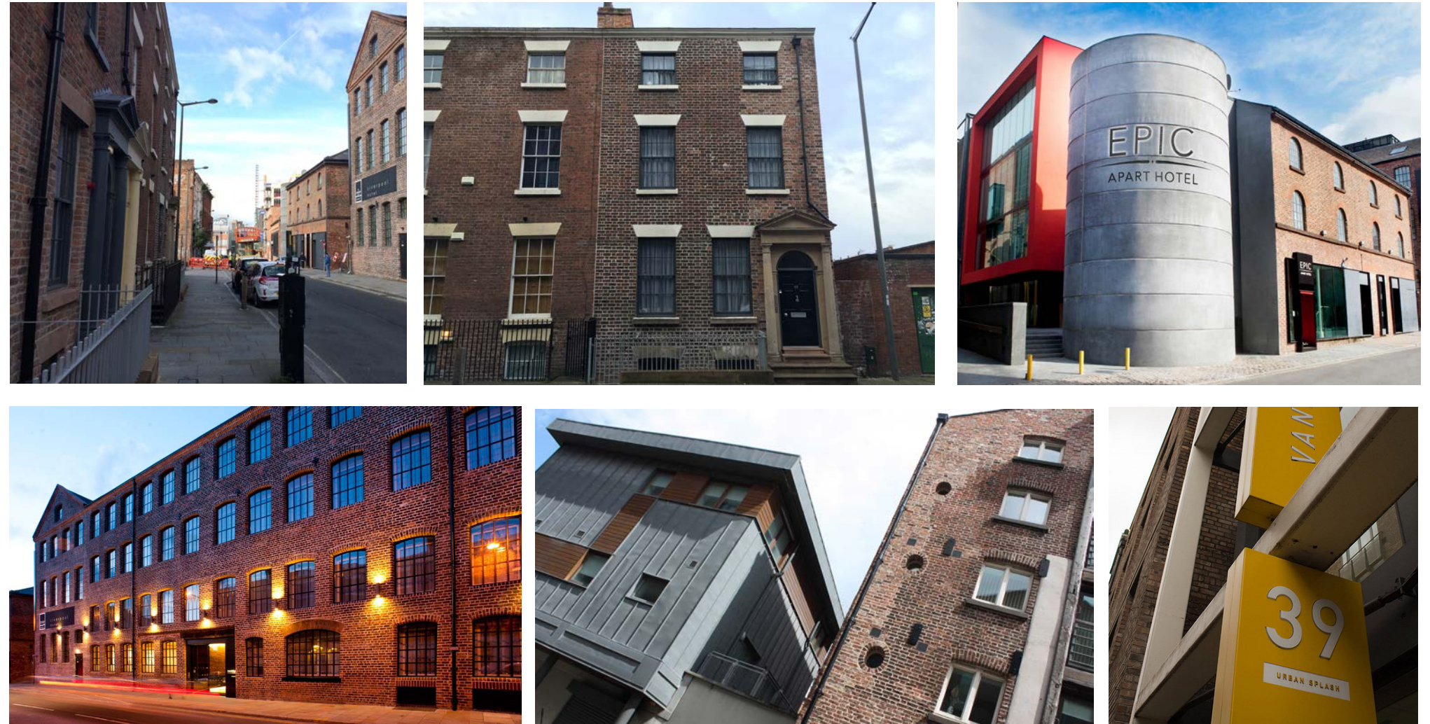
Brick-built buildings and recent renovations in the vicinity of Seel Street

The proposed building will aim to provide a key junction between these differing material palettes and architectural styles, striving to create a seamless link between the historic heritage buildings and the modernism within the City Centre. It will aim to fit within the family of buildings surrounding its key position, taking inspiration for the scale, massing and layout from the surrounding context.