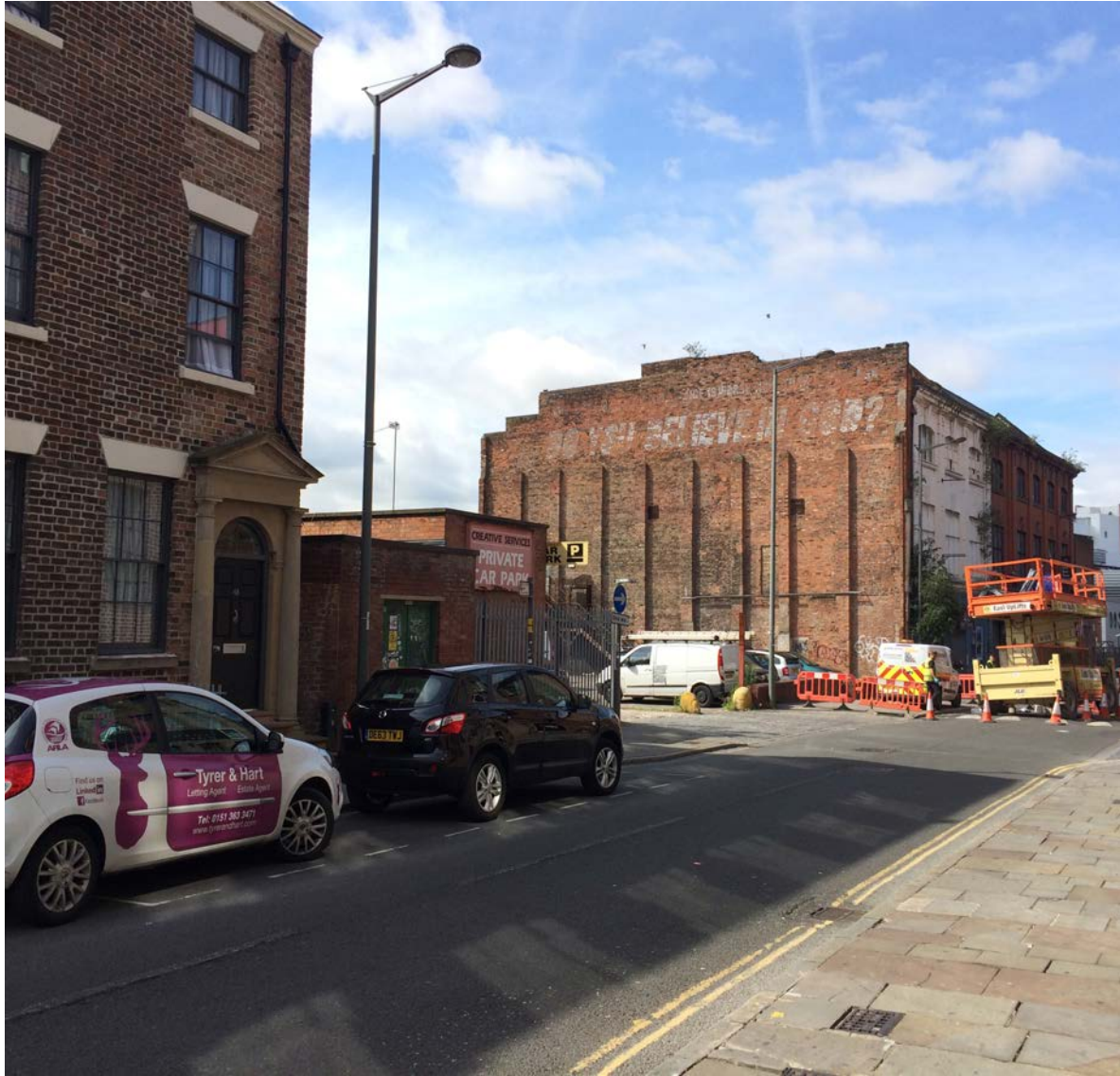
01. View from Seel Street towards site