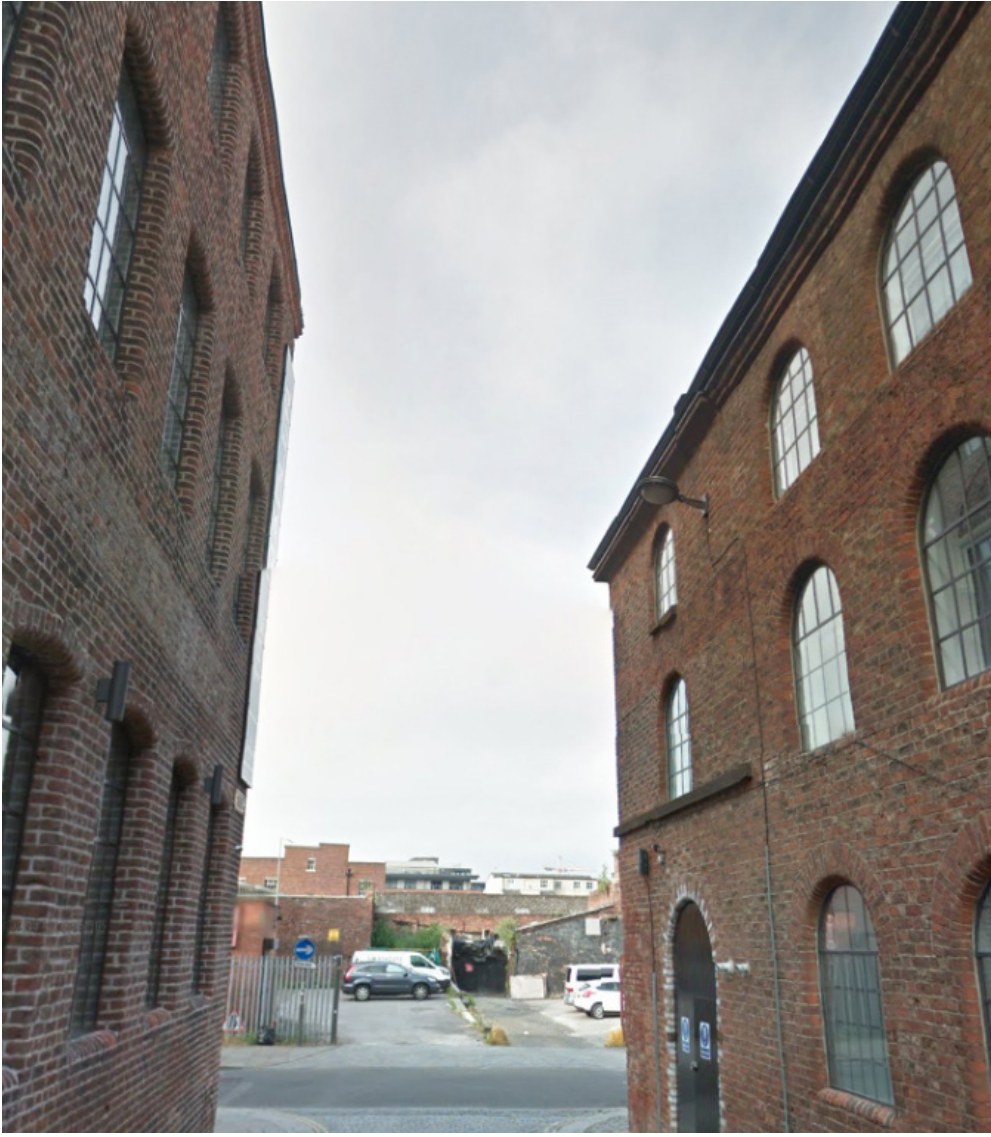
02. View from Concert Street towards the site