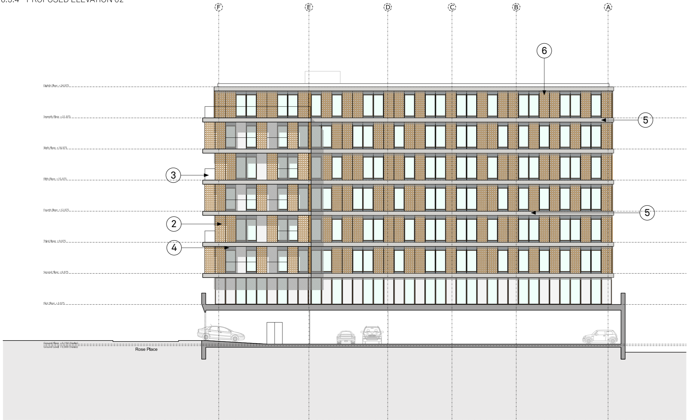
6.5.4 - PROPOSED ELEVATION 02