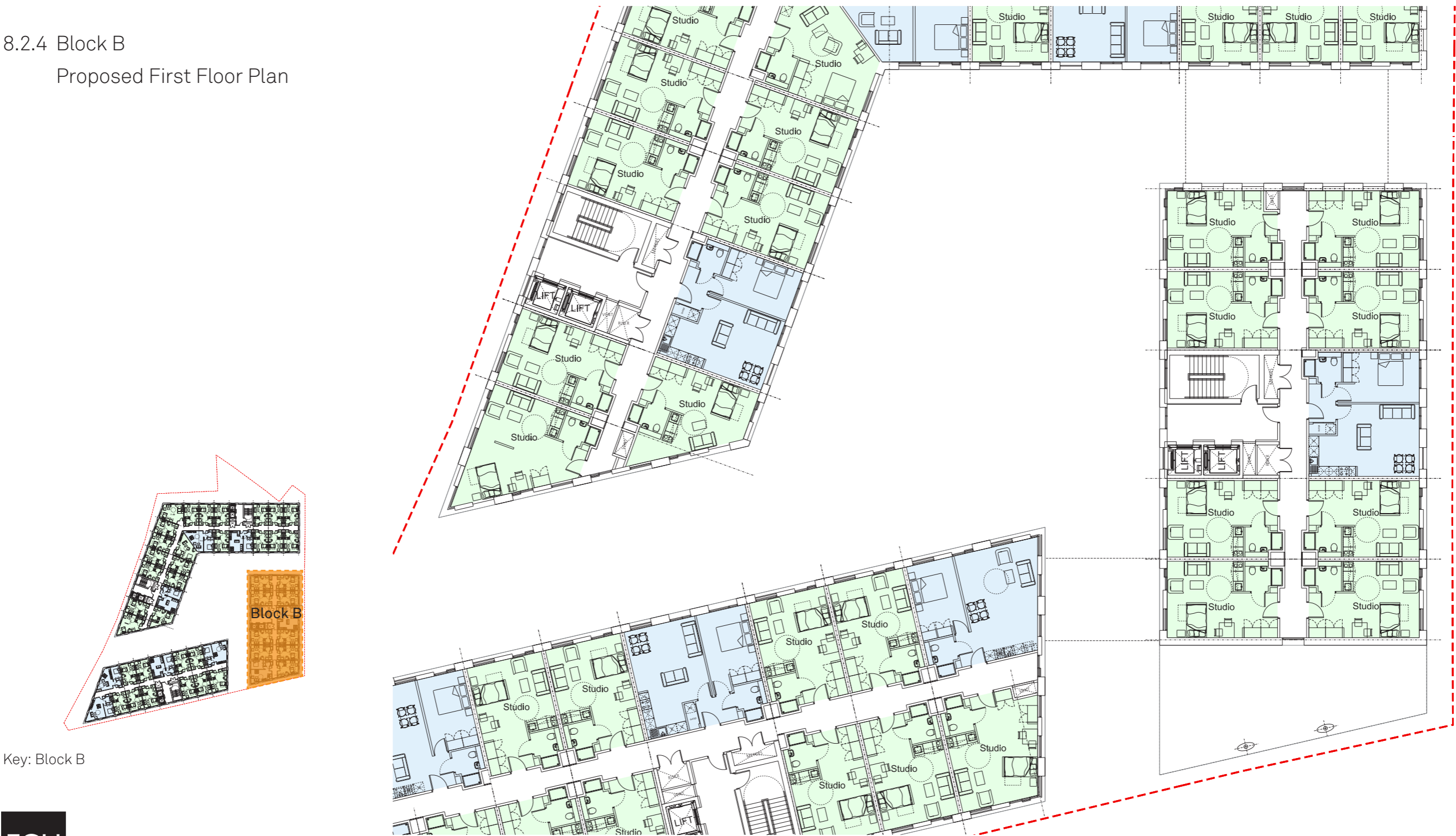
8.2.4 Block B Proposed First Floor Plan