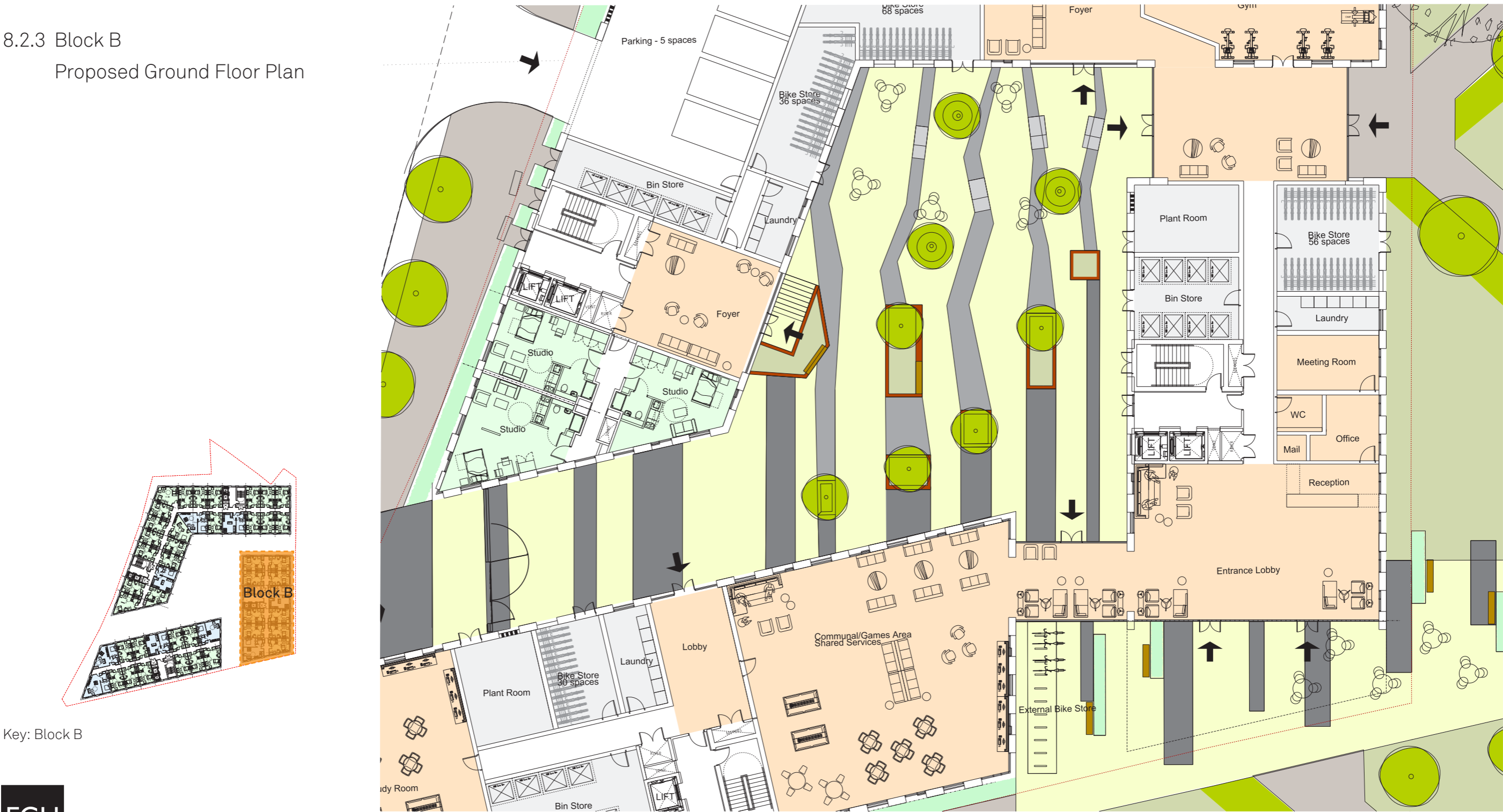
Key: Block B