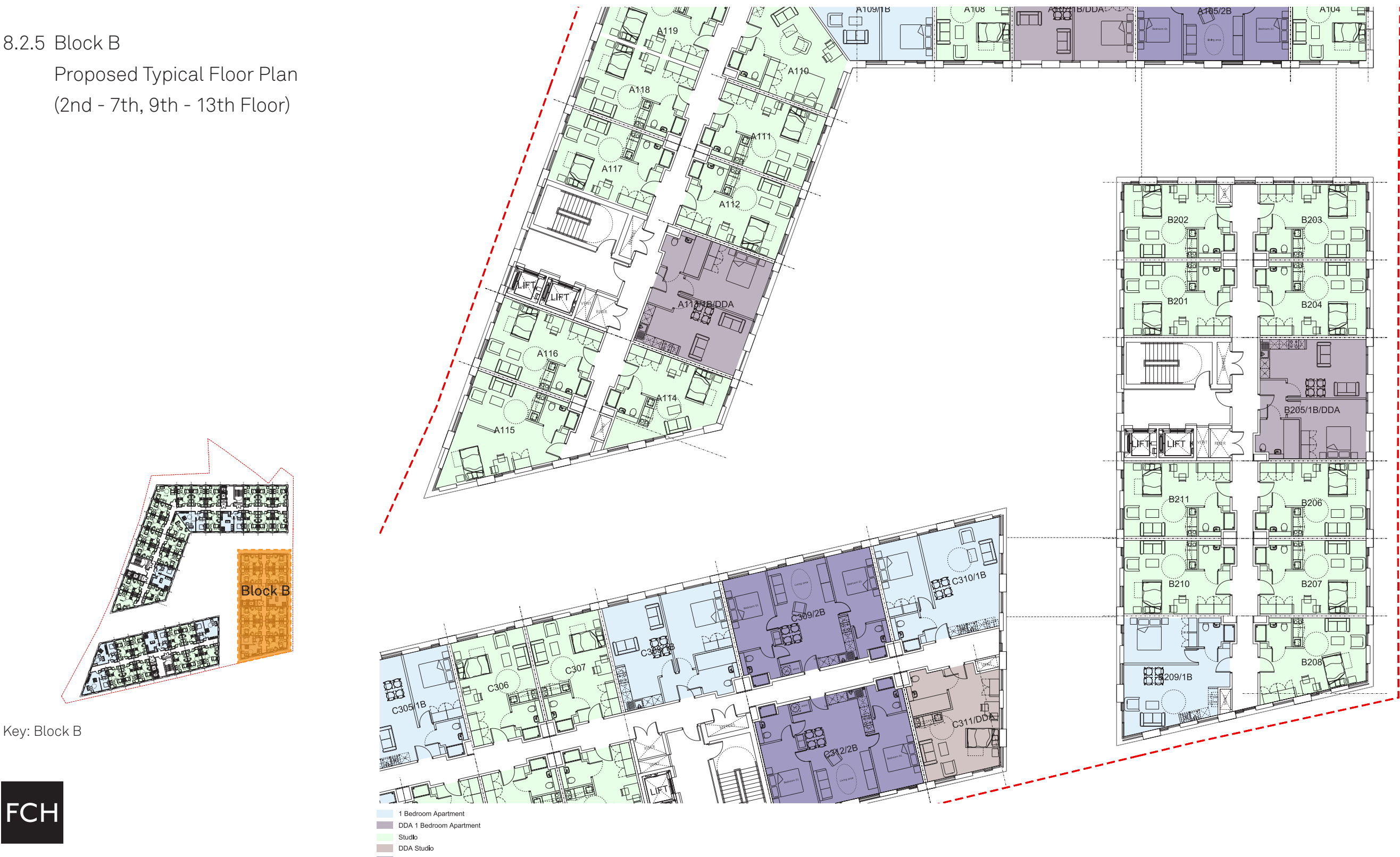
8.2.5 Block B Proposed Typical Floor Plan (2nd - 7th, 9th - 13th Floor)