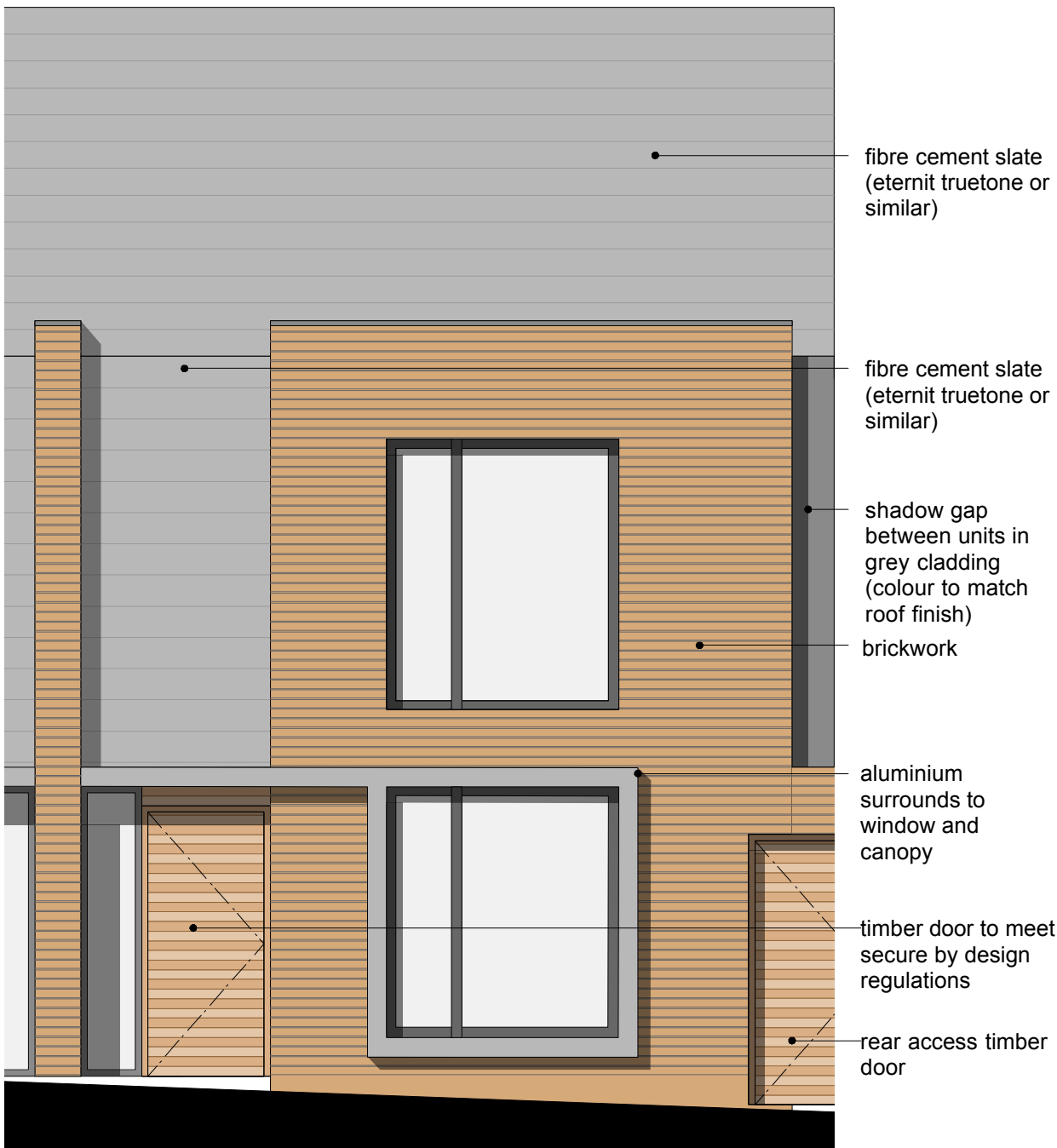
Detail Elevation scale 1:50