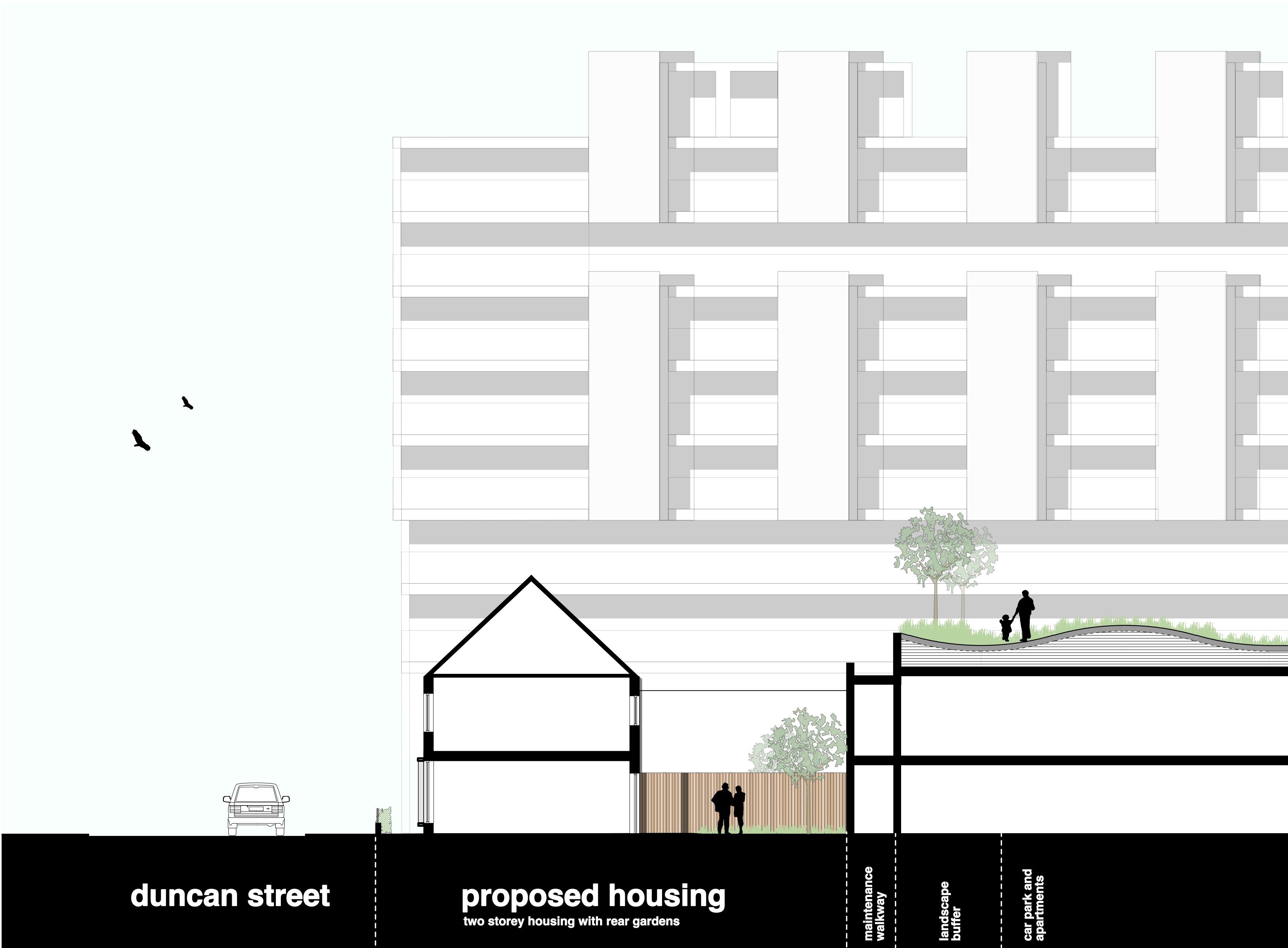
Site Section B scale 1:100