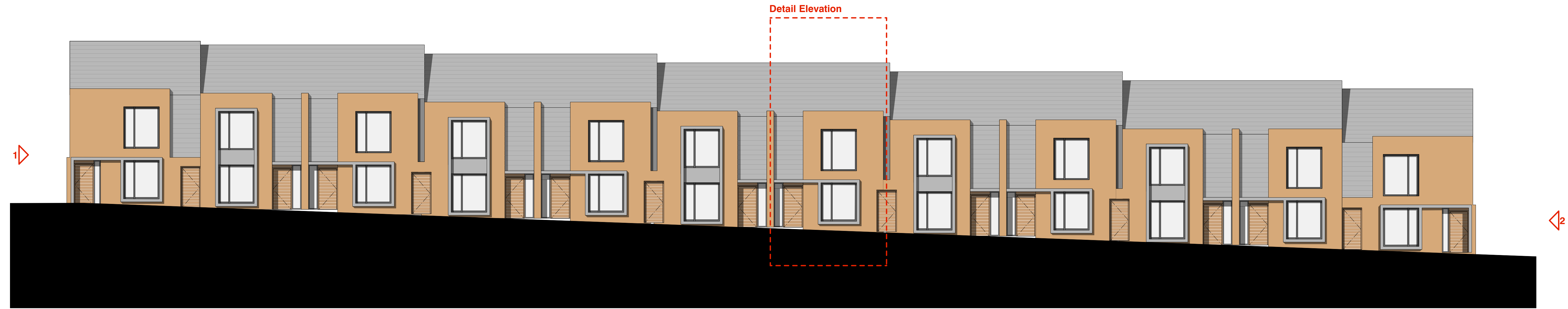
Street Scene A scale 1:100