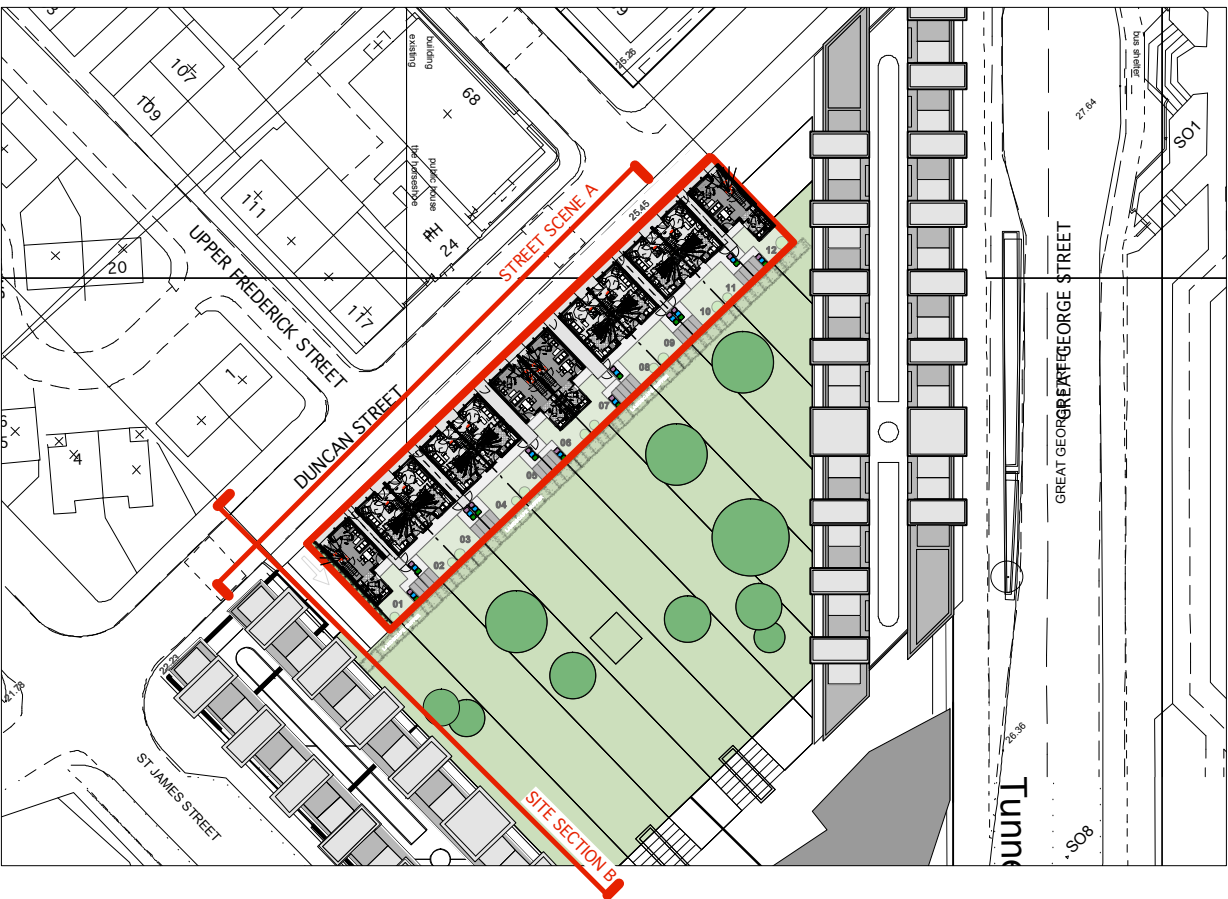
Site Section Key nts

Revision: First Issue: 10.12.2013 RevA: 26.02.2014 RevB: Amendments to elevations following Planner comments - AKW - 04.03.2013 RevC: Amendments to elevations following Planner comments - AKW - 07.03.2013