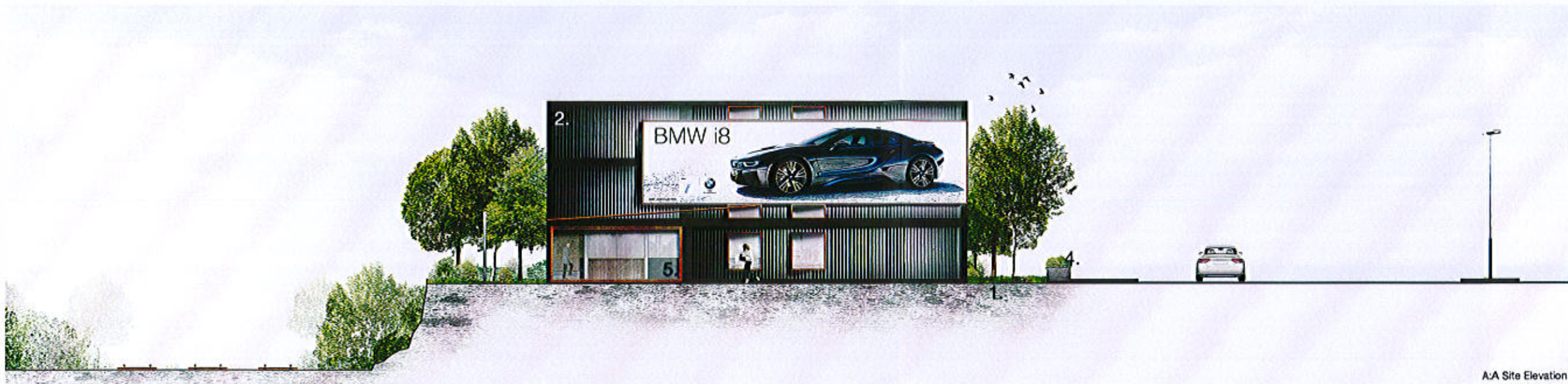
A:A Site Elevation

22 Berghem Mews Blythe Road London W14 0HN www.wildstone.co.uk 020 7313 9571