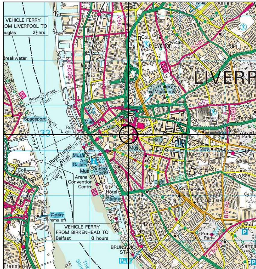
SITE LOCATION SCALE 1:50000

Ordnance Survey map extract based upon Landranger map series with the permission of the controller of Her Majesty's Stationery Office. Mono Consultants Limited licence no. ES100017753. Crown copyright.