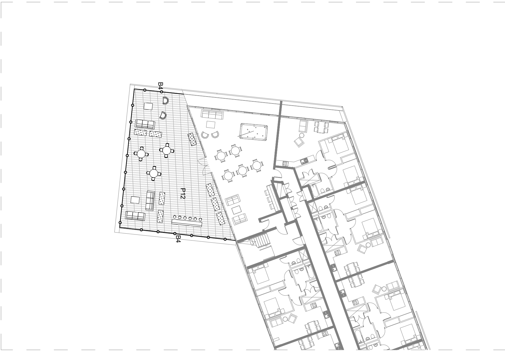
8th Floor Terrace Plan 1:250 @ A1