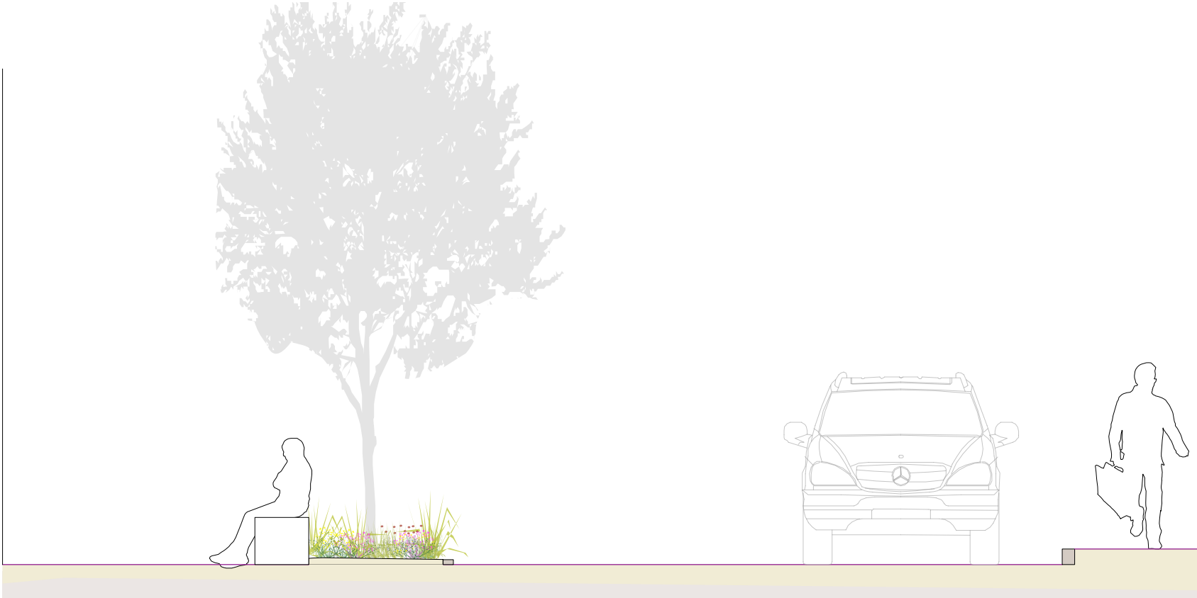
SECTION B - B'