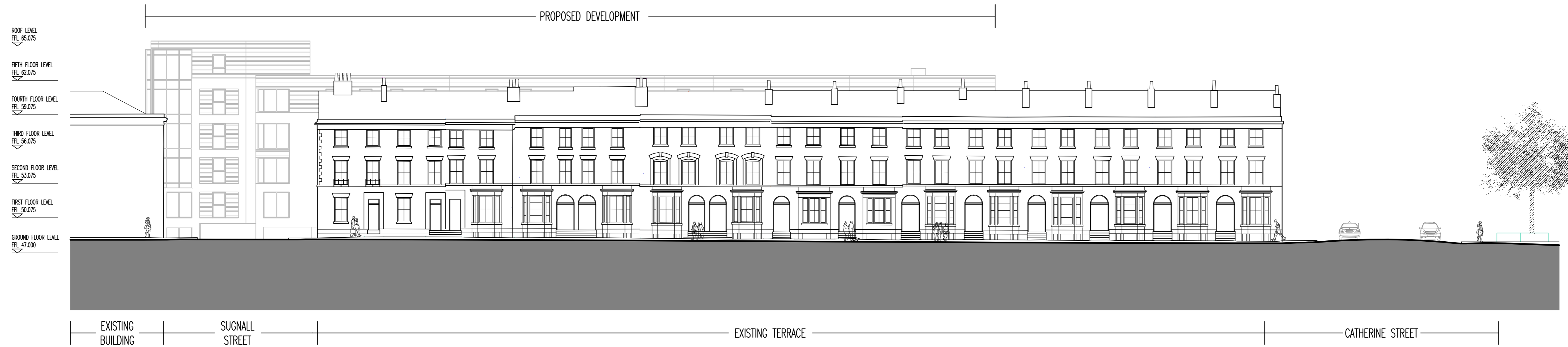
FALKNER STREET ELEVATION