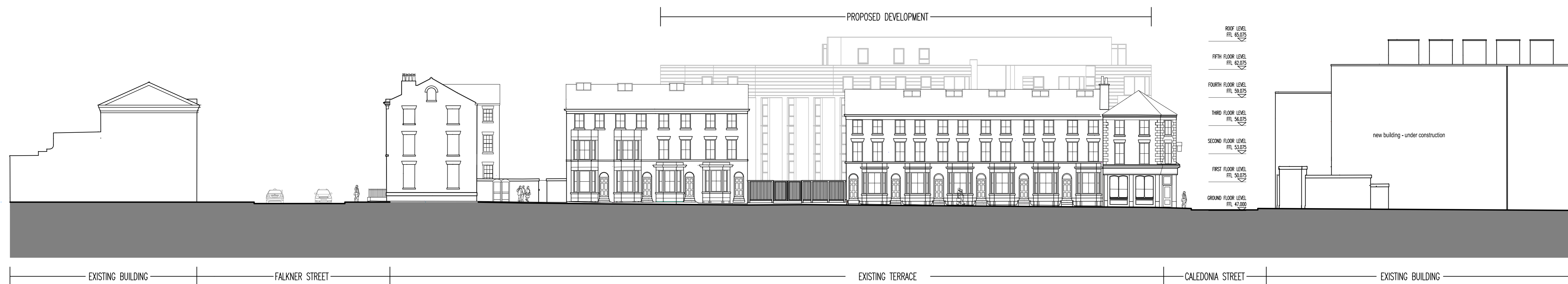
CATHERINE STREET ELEVATION