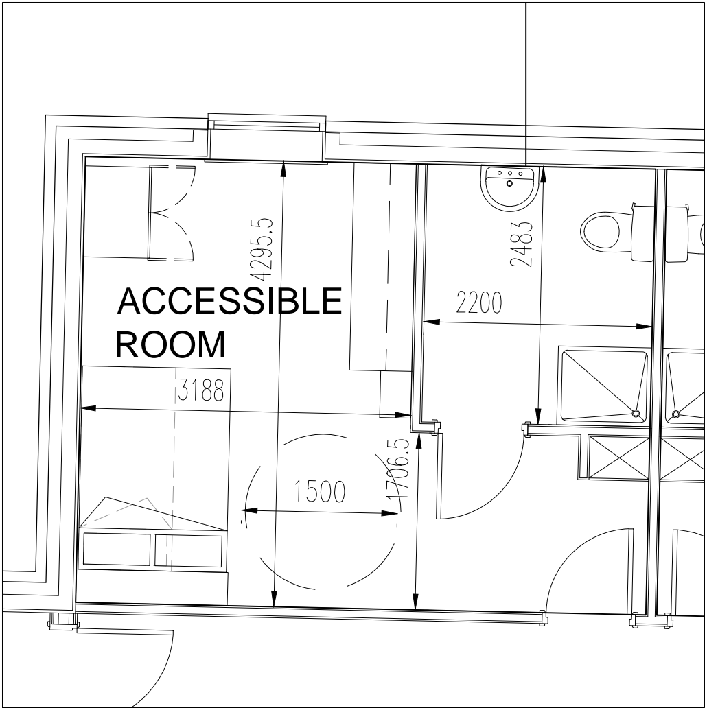
ROOM LAYOUT B (5 No.)