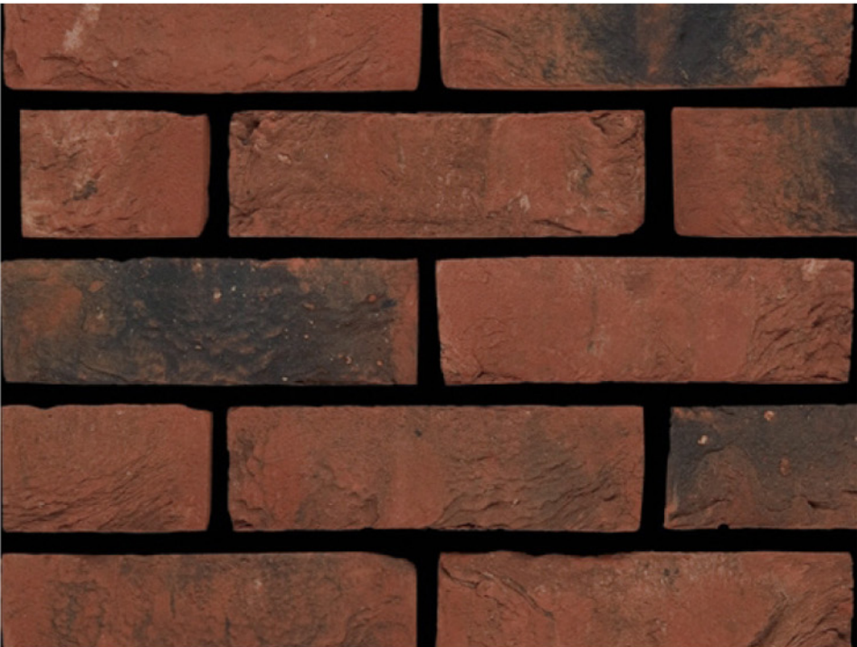
POSSIBLE COMPLIMENTARY BRICKS: FINAL SAMPLES SUBJECT TO THE APPROVAL OF THE PLANNING AUTHORITY.