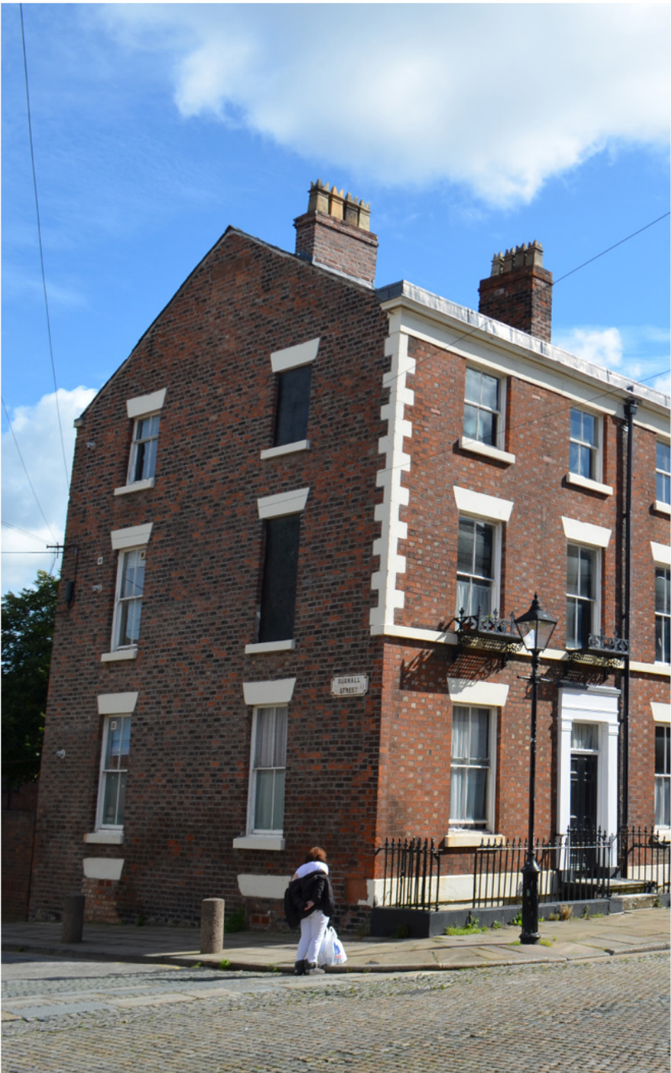
IMAGES OF EXISTING FACADES OF SURROUNDING TERRACES ILLUSTRATING EXISTING BRICKWORK: WE WILL SEEK TO MATCH A COMPLIMENTARY BRICK.