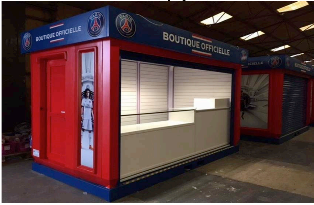
Typical Rapid Retail Pop-Up Unit