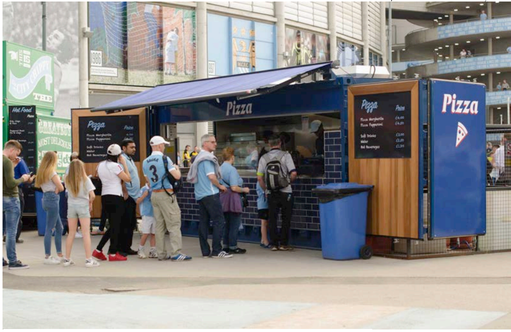
Typical White Circle Shipping Container Unit