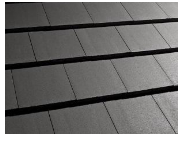
Russell Grampian roof tiles Slate Grey