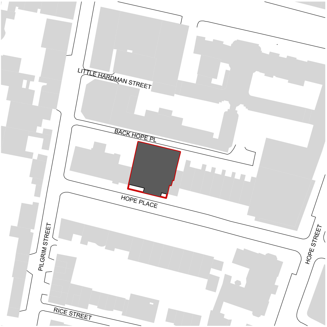
Existing Location Key Plan