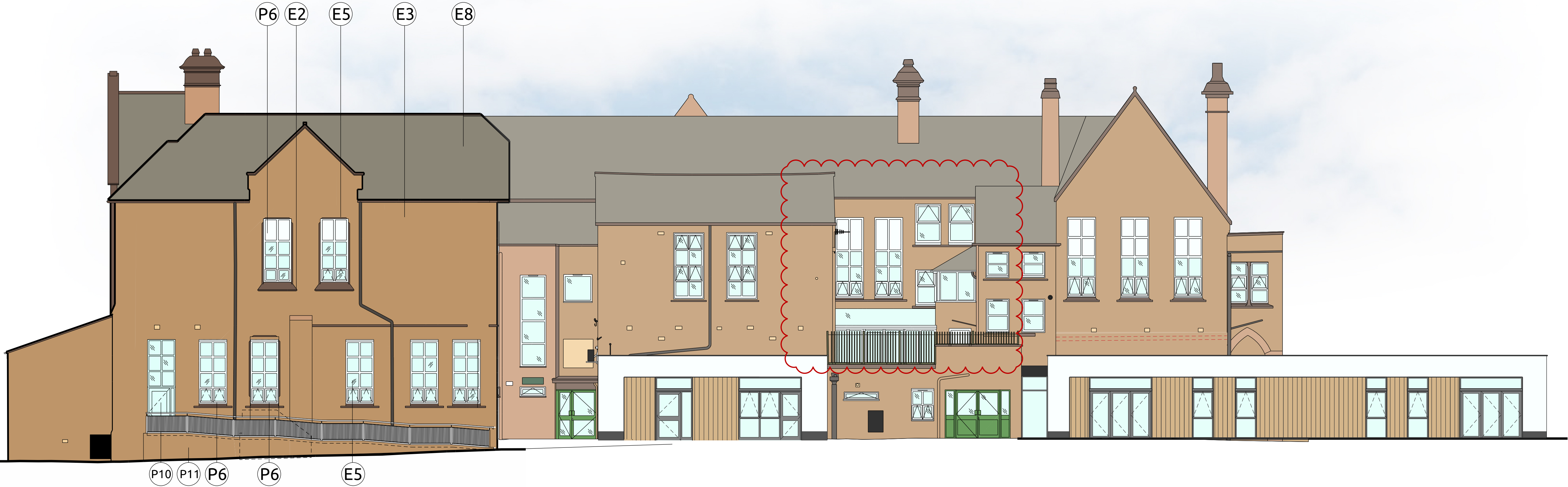
Proposed Elevation C