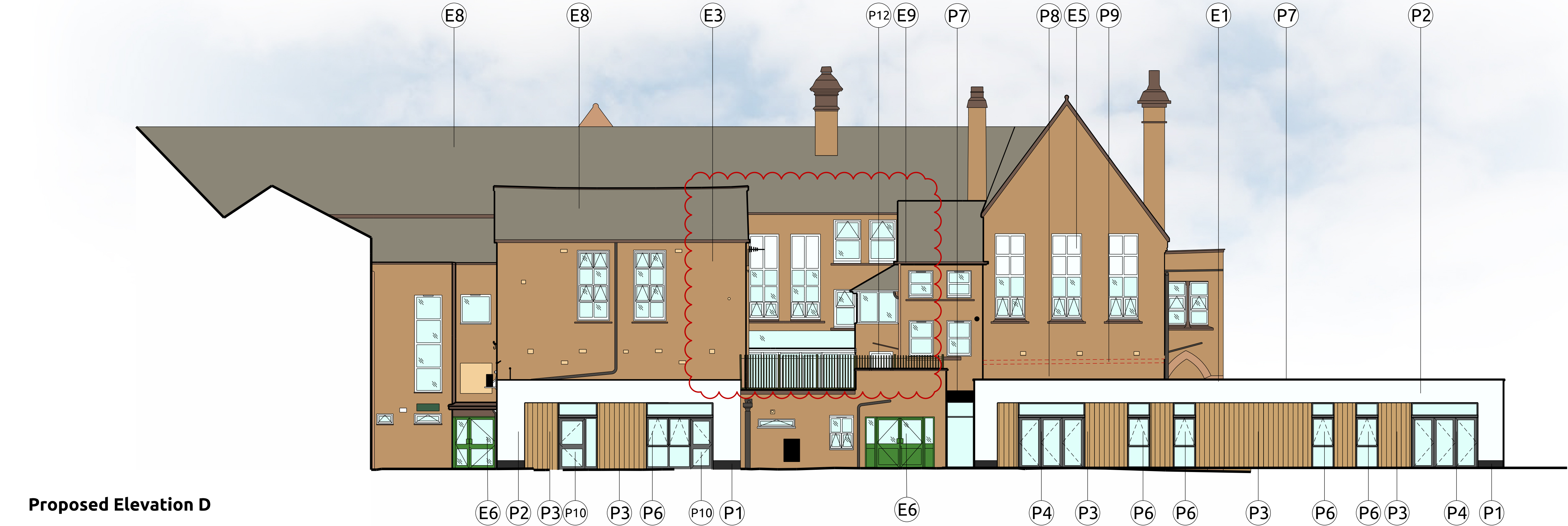
Proposed Elevation D

Note: Elevation Survey Drawings provided by SEP (Site Engineering Personnel) Ltd. These drawings provide an illustrative overview of the design intent only.