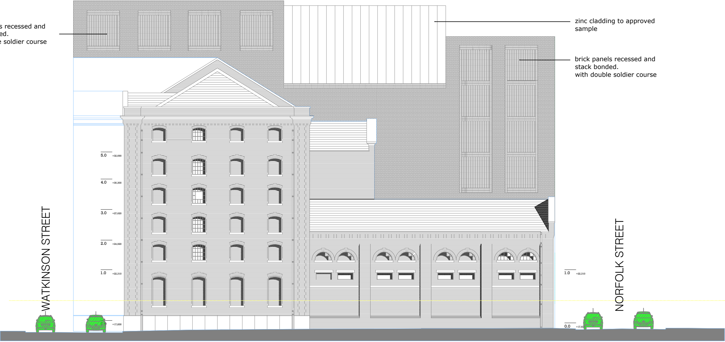
JAMAICA STREET ELEVATION/REV A

brick panels recessed and stack bonded. with double soldier course