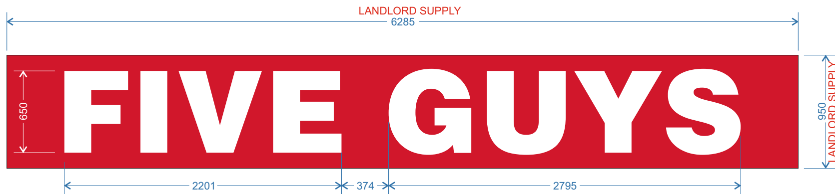
Sign Layout Scale 1:30