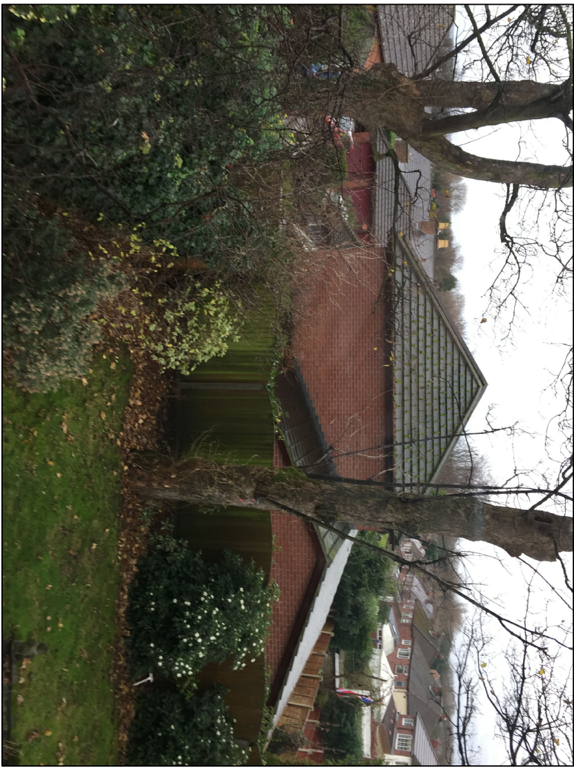
Tree 1 and Neighbouring Tree