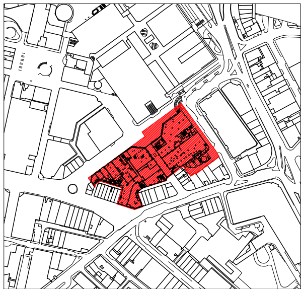
KEY PLAN_[SCALE 1:5000 @ A1]

This drawing has been produced from files and drawn information provided to Benoy by the client. Benoy cannot guarantee the accuracy of these plans and would recommend that a full survey of the building and surrounding areas be carried out prior to any and all works commencing.